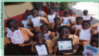
Conference Organisers: Elsie Oweusu Architects Ltd World Rhythms

Supported by the Ghana Government and the private sector, cause will network and communicate with regional organisations in Africa, complementing NEPAD's environmental programme. cause will also work with international organisations, including UN-HABITAT, UNEP, UNESCO, ISA, ACOPS and the GLA.