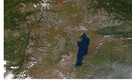
Figure 1. The Khusgul lake

Khuvsgul lake is located in the northwest of Mongolia, at the foot of the eastern Sayan Mountains (Figure 1). It is 1,645 m above sea level, 136 km long and 262 m deep. It is the second-most voluminous freshwater lake in Asia, and holds almost 90% of Mongolia's fresh water and 0.4% of all the fresh water in the world.