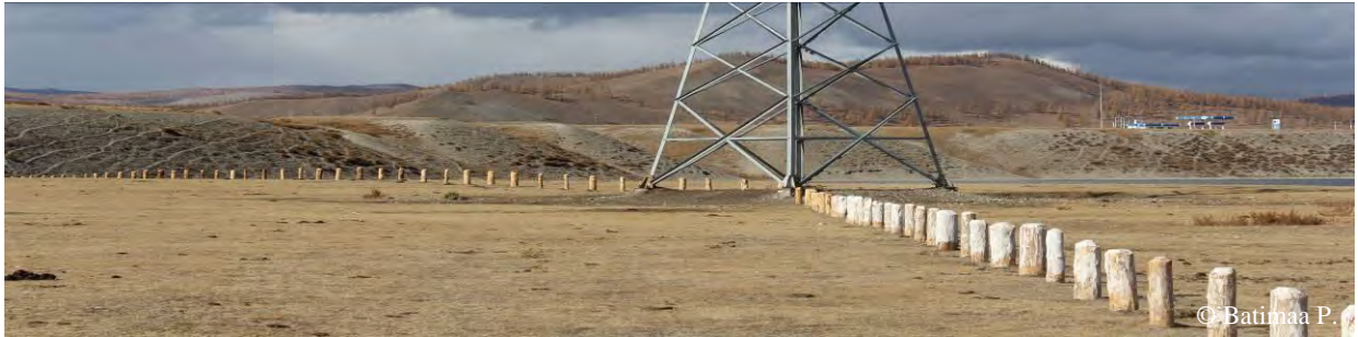
Figure 4. The sanitation zone protection pole

There has been installed protection pole with distance of 1.5 metre along the sanitation zone of Khuvsgul lake near to Khatgal village for 2 km distance in order to protect the sanitation zone from pollution by washing of vehicles and camping of backpack tourist. The area covers 300 metre from bridge at Eg River to the "fish value" and 1700 metre from the water collection point (the place from where the citizens of the Khatgal village collect water from the lake) of the lake to the southern bend of "Damjlag Baaz" (Figure 4).