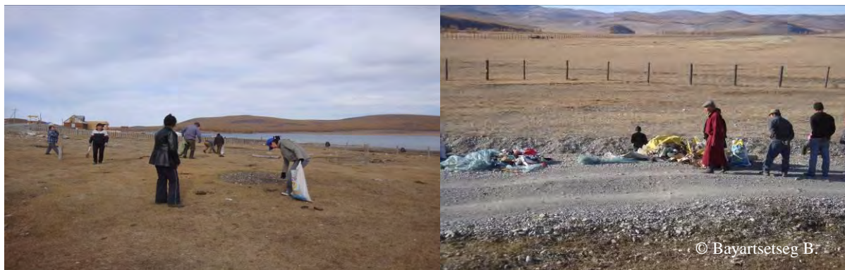
Figure 3. Clean up campaign

The Khatgal Village Government has announced the day of 28 th September as a day for cleaning-up campaign. As a result all citizens of the village and all government and non-government organizations involved in the campaign and cleaned the solid wastes over 3500 ha areas covering from Jankhai (west bank of the lake) to Eg River bridge and from the bridge to the site "Mergen" site (east bank). Over 200 people from 20 organizations have involved in this cleaning-up campaign and cleaned over 70 tones (or 15 trucks) of solids wastes. Overall, this activity was well organized and effectively implemented (Figure 3).