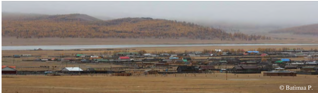
Figure 2. Khatgal Village

Khuvsgul lake is one of seventeen ancient lakes worldwide more than 2 million years old and the most pristine and is the most significant drinking water reserve of Mongolia. Its water is potable without any treatment. Khuvsgul is an ultraoligotrophic lake with low levels of nutrients and primary productivity and high water clarity. The Lake area is a National Park bigger than Yellowstone and strictly protected as a transition zone between Central Asian Steppe and Siberian Taiga. The town of Khamgal is at the southern end of the lake (Figure 2).