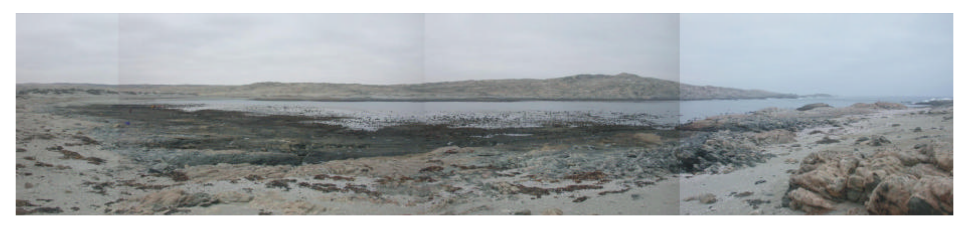
Plate 2. View of Atlas Bay showing the extent of the kelp bed. The access track to the study site ends in the bottom left hand corner of the photograph.

Plate 1. View of the South Jetty study site with the sea water intake jetty and Elizabeth Bay Mine in the background.