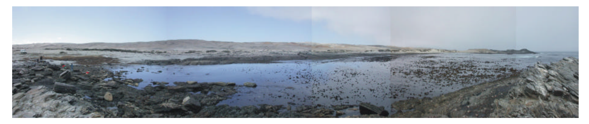
Plate 4. View of Reef Bay. Vehicle access is possible at two points in this bay.

Plate 3. View of Wolf Bay. The access track to the study site ends at the bottom right of the photograph. North Long Island (which supports seals) can be seen in the right of the picture.