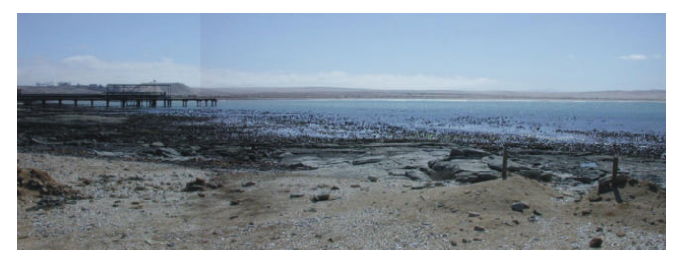
Plate 1. View of the South Jetty study site with the sea water intake jetty and Elizabeth Bay Mine in the background.