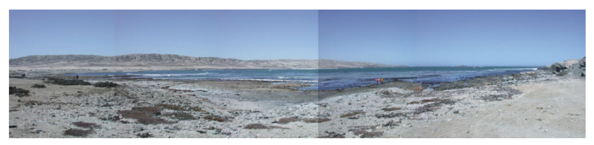
Plate 3. View of Wolf Bay. The access track to the study site ends at the bottom right of the photograph. North Long Island (which supports seals) can be seen in the right of the picture.