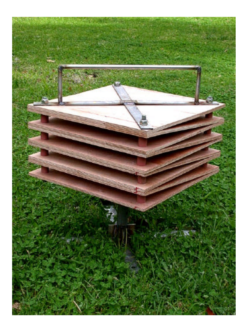
Plate 5. Booth crevice collector and base-plate.