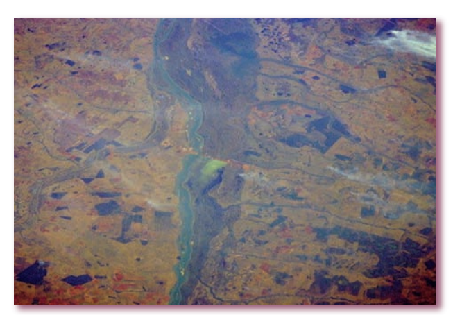
Figure 8. Satellite image of La Plata River Basin (Argentina-Bolivia-Brazil-Paraguay-Uruguay)

over specific issues, training and skills development, continued workshops and seminars, public audiences, hands-on pilot demonstration projects, and use of electronic means, are all tools that can help communities and stakeholder groups understand, and support IWRM efforts. Emphasizing participation of relevant stakeholders beginning with the earliest stages of project formulation