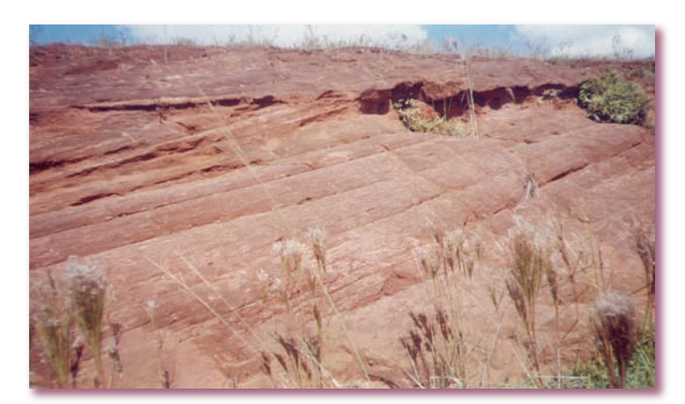
Figure 4. Guarani outcrop at Itapúa (Paraguay).

Generally, defining a shared sustainable development vision for the area or Basin concerned, or identifying development scenarios by key stakeholders, can facilitate the preparation of a SAP that includes development perspectives and sustainability conditions complementing the environmental priorities defined through the TDA. With this approach, the resulting SAP is not limited to solving priority transboundary environmental issues, but also provides a general framework to promote sustainable development.