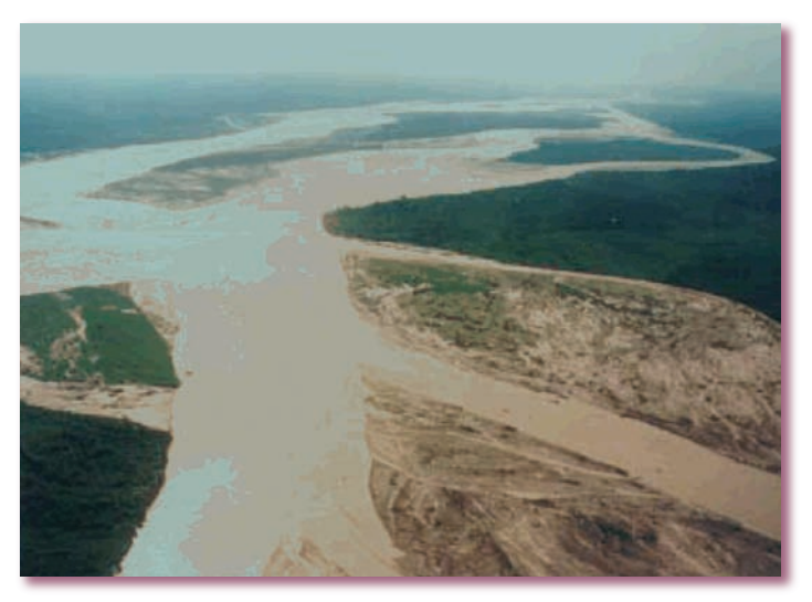
Figure 5. Aerial View, Bermejo River Basin.

Activity 3.7. Preparation and Publication of Final SAP Document. Under this activity, the final document is prepared by the technical team, incorporating comments and suggestions from the consultation and validation process. While there is no specific or common standard regarding structure and content, SAP documents should include: i) an introductory section with the overall framework and justification for action; ii) a synthesis of the TDA analyses and agreed-upon issues; iii) the general and specific objectives of the SAP, priority measures (program of actions) and targets; iv) implementation plan, outlining responsibilities, commitments and financing; v) public participation plan; vi) monitoring and evaluation plan; vii) risks and sustainability; and viii) relevant annexes.