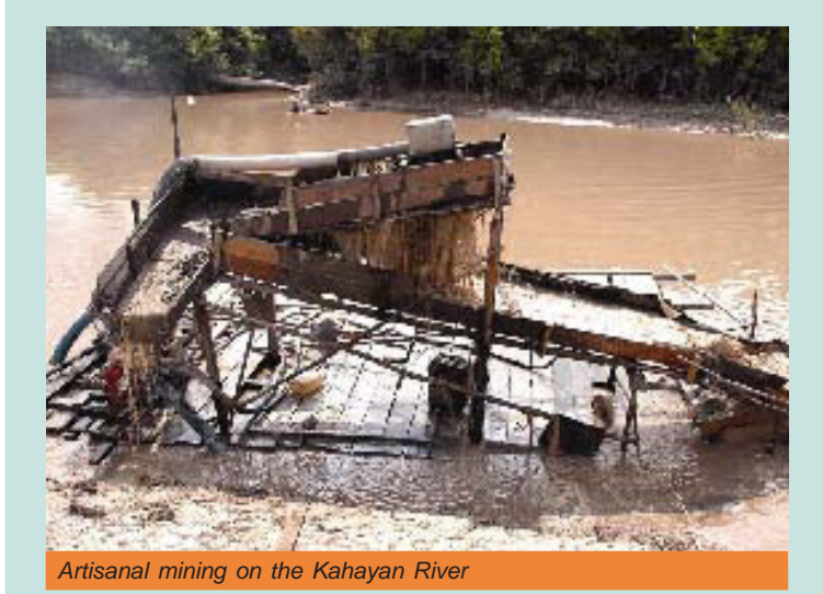
Mercury evaporation from burning activities produces mercuric vapor in the air, which falls to the ground with rainwater, contaminating lakes, rivers and oceans. Most of this mercury deposition sticks to sediments and some is transformed into the highly toxic form of methyl mercury, by small organisms and bacteria. Snails and small shrimps then absorb methyl mercury from sediment and water. Fish that consume these contaminated snails and shrimps or other fish, will accumulate high levels of methyl mercury. Methyl mercury dissolves easily in water, and harms both respiratory functions and the metabolic system.

People who burn mercury to get gold from amalgam are especially threatened by mercury exposure. When the body ingests more mercury than the normal amount, various health problems result, especially if it contaminates the body in the form of methyl mercury.