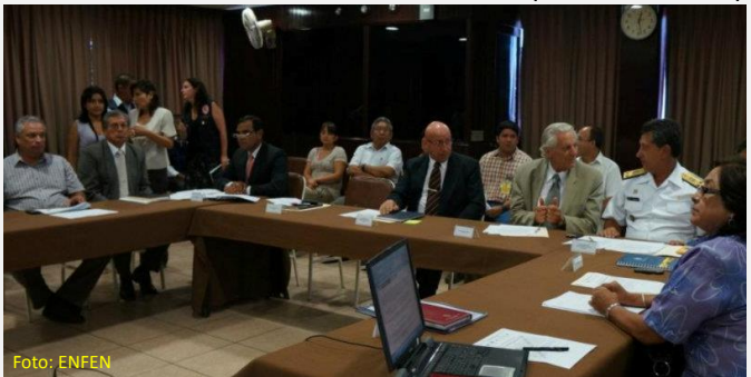
Despite the increase of rain index and river fluxes the current conditions are inside the expected values for the summer season.

temperature, SST and MSL continue around normal conditions for the rest of summer 2013.