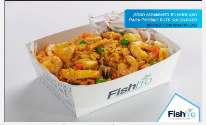
With the entry of this national franchise, new opportunities for the development of fish consumption are opened, based on an offer of "blue fish" such as anchovy or mackerel, rich in Omega 3.

In the Ignacio Merino 2283 Avenue, behind the Lince market (near the block 22 of Av Petit Thouars) a very interesting franchise called "Ceviche FishITo Factory" was opened. It is the only restaurant in Lima that offers fresh anchovies on their menu. They also have crispy fried fish potatoes, anchovies in barbecue sauce, mango ceviche and other oily fish originalities. It is a self-service fast food enterprise that must be supported by the public. The menu is good, the idea is great, the extra effort and prices for all economies. Eating anchovy there is a unique experience, Excellent ! (by F. Miranda, OANNES NGOs).