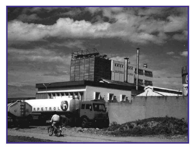
Brarudi Brewery: one of over 70 industries in Bujumbura

food processing, textiles, metallurgy, chemicals and pharmaceuticals, petrol warehouses and garages, soap manufacturers, slaughterhouses, paint refineries, printing houses, and so on.