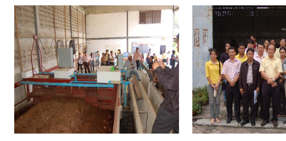
Picture 3.2 Site visiting for training of trainer course Compost factory at Saraburi province