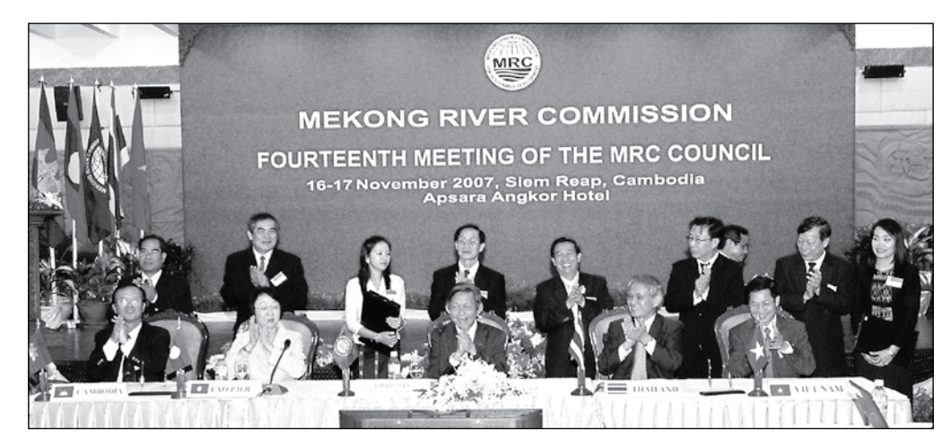
A good end to a good meeting as the minutes are signed in Siem Reap.

It was reported that in 2007 the MRC signed agreements worth over US$20