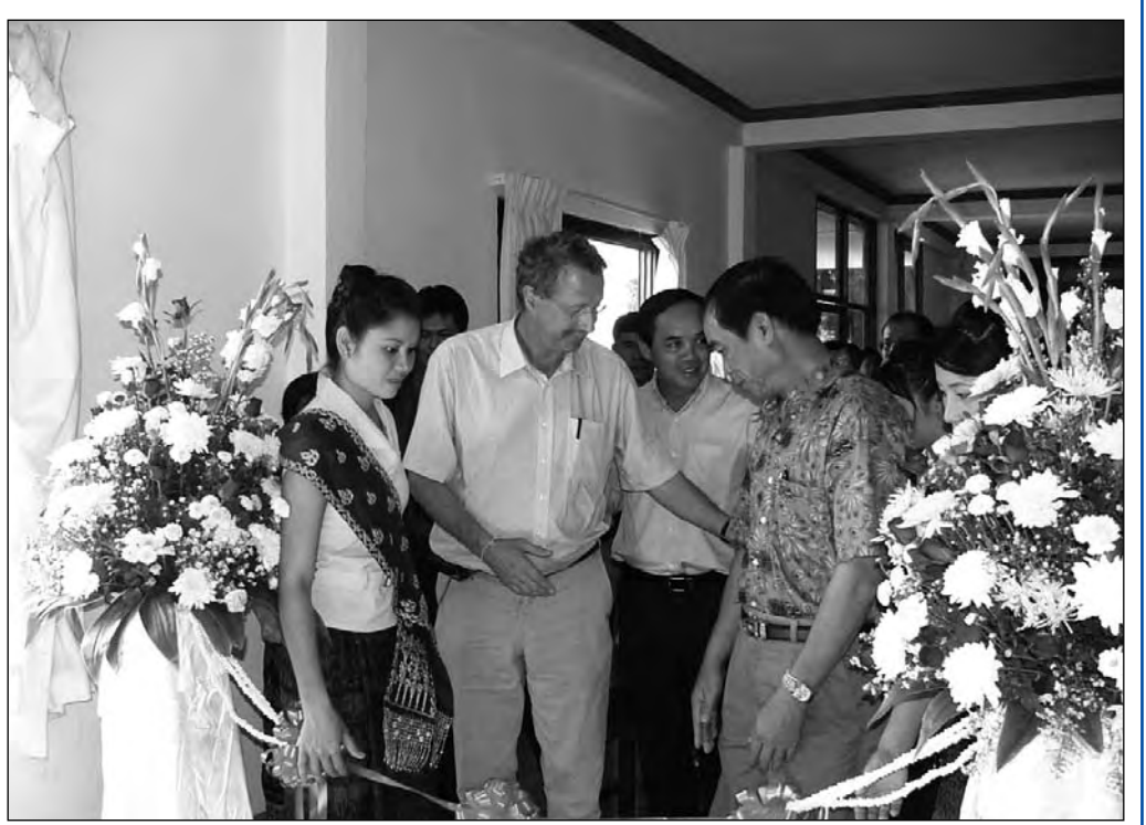
Local fishers play a vital part in the monitoring of species in the Mekong at all the monitoring sites throughout the basin

The offices can act as communication platforms for news, knowledge, and all kind of data on sustainable watershed management and it is hoped that they will become gathering points for all concerned with watershed management, eventually developing into more sophisticated watershed management centres. Local people, extension workers, and