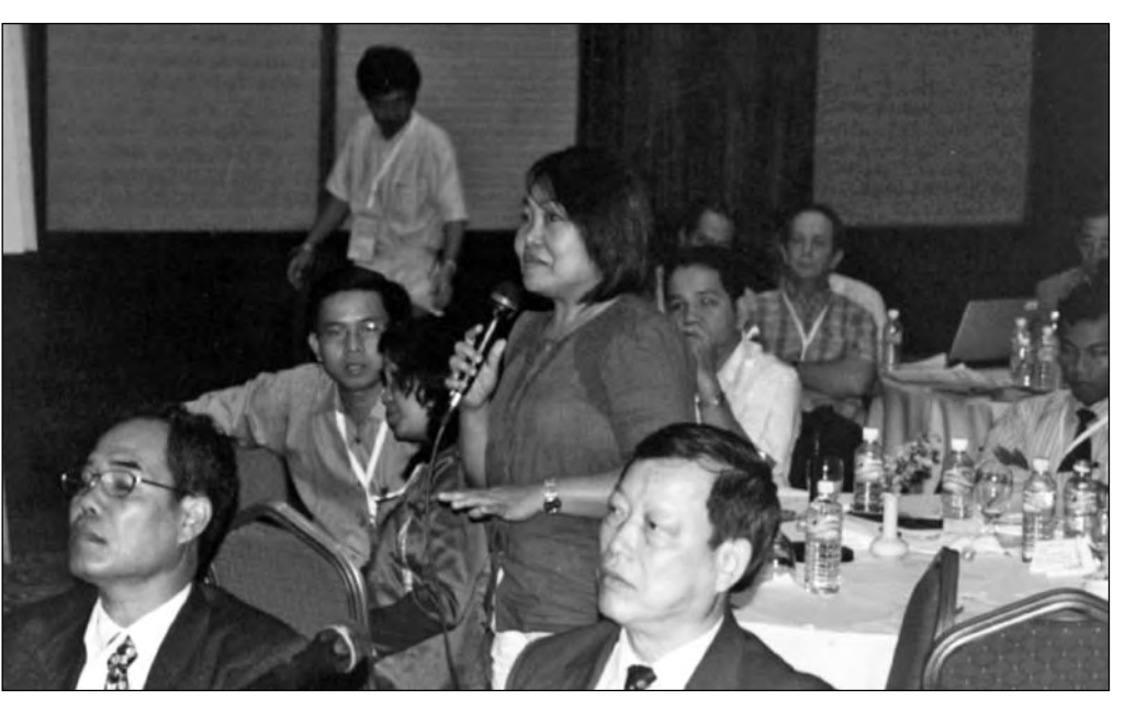
Representatives of many parts of society came to add their voices to the Basin Planning Process.

MRC staff pointed out that there are no magic solutions to the challenges facing basin decision makers. While research, monitoring and scientific modelling can provide much information on current situations, and on the possible effects of large individual projects such as storage dams, the cumulative effects of rapid development will affect rivers and the communities around them in ways that cannot be exactly determined. The BDP