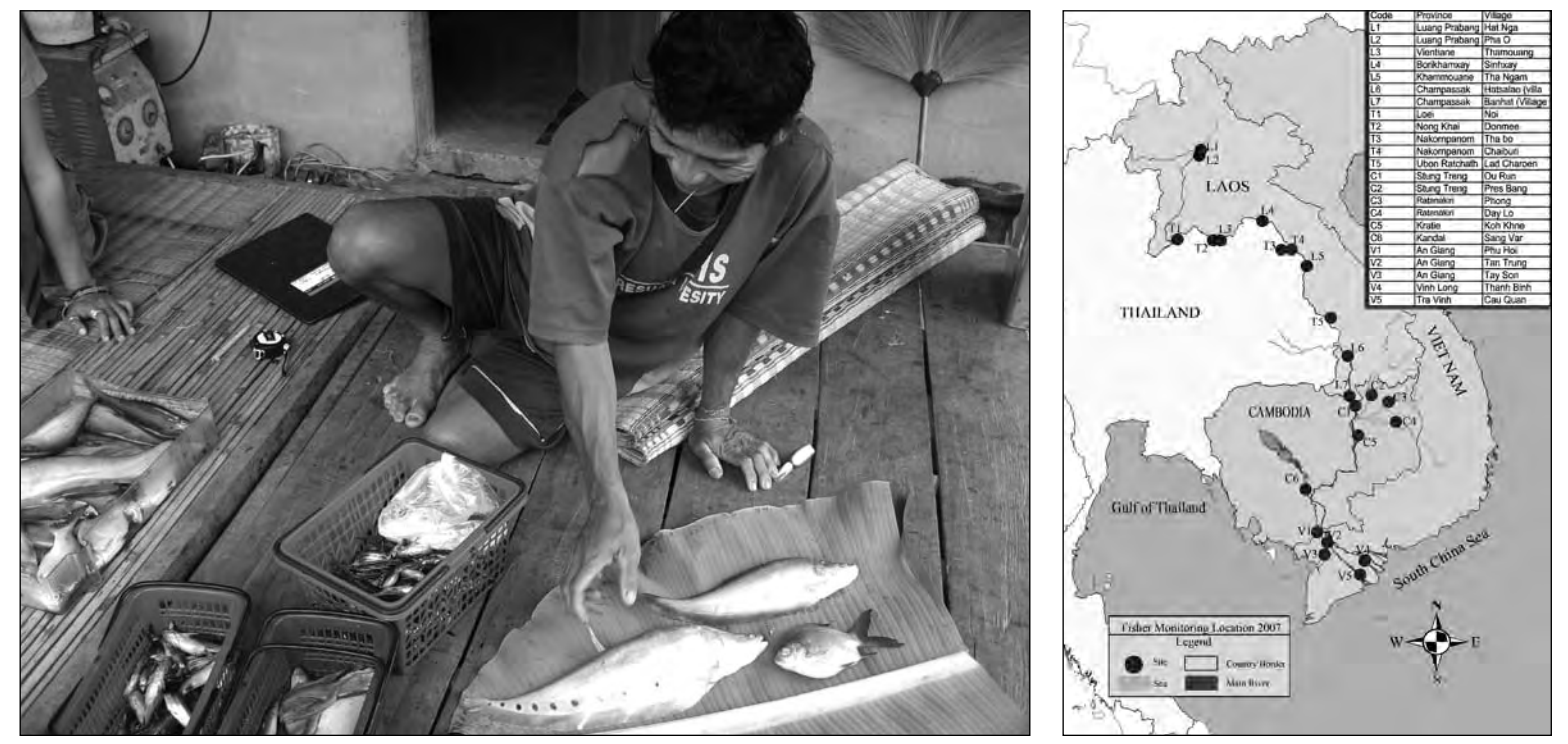
Local fishers play a vital part in the monitoring of species in the Mekong. at all the montioring sites throughout the basin

Local fishers began monitoring the abundance and diversity of fish in June 2007 at 23 sites in four habitats (mainstream, tributary, flood plain and estuary). At each site fishers recorded their daily