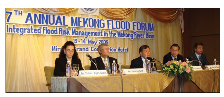
Integreated flood risk management can help to mitigate the negative effects of flooding in the Mekong River Basin

The report said that there is room for improvement in the accuracy of satellite rainfall monitoring tools, and how the data they provide gets checked against measuring stations on the ground – a