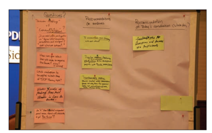
Delegates gave input into the draft BDP2 Stakeholder Participation and Communication Plan.

participation within the MRC Joint Committee and Council for feedback and comment; and