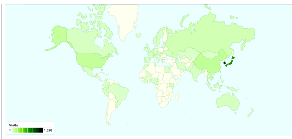
2,759 visits came from 74 countries/territories