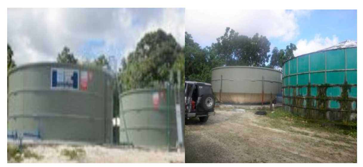
Figure 9: The two new 240 kL storage facilities at Alofi South

The project has seen the replacement of the existing tank with two new 240 m<sup>3</sup> storages, increasing storage by over 45% and significantly increasing supply security by eliminating storage leakage losses.