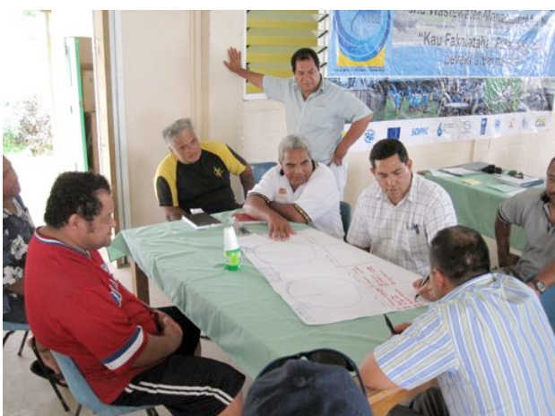
Figures 2 & 3: Gender Mainstreaming in developing Village Waters Management Plan