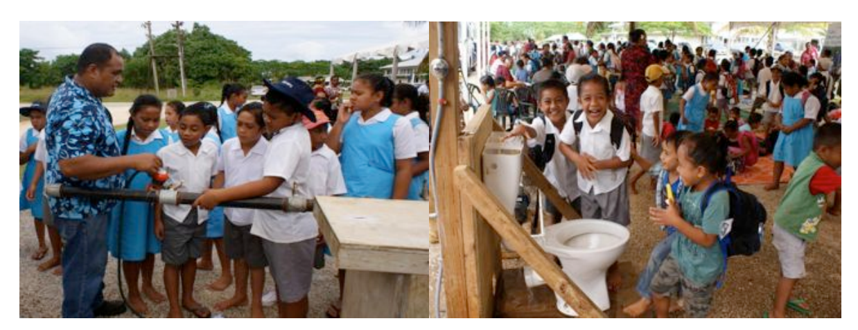
Figures 6 & 7: World Water Day 2012 celebration and the launching of Pacific Blue Ribbon

Developing and implementing a National Communication Strategy has started to increase the awareness of the people of Niue on the importance of water resource management and in particular, conservation measures that are vital for ensuring that water is safe for consumption and use. The importance of safeguarding natural supplies for future generations and the increasing risks posed by climate change are starting to be recognised. Annual World Water Day events have become important at a national level as a mechanism for bringing people's attention to water resource management issues. Participation rates at these events is as high as 50% of the national population. National Project Coordinators from a range of initiatives coordinate on planning and how to ensure successful awareness campaigns.