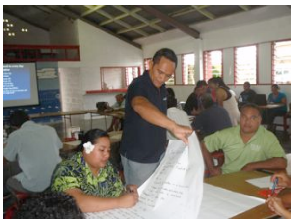
Figure 12: Implementation of Village Water Management Plans