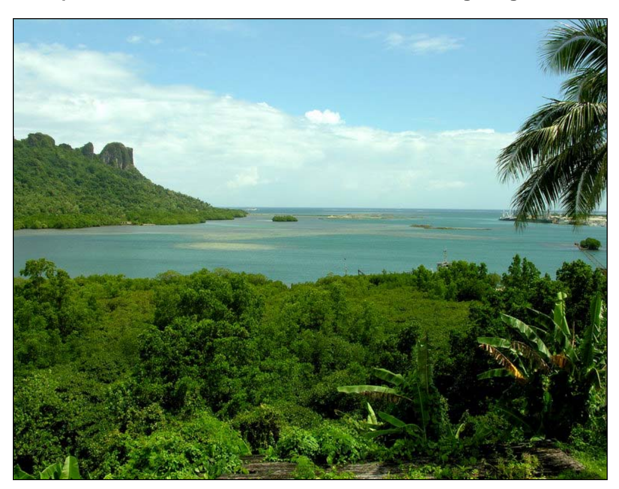
Pohnpei Island, Federated States of Micronesia 8<sup>th</sup> – 12<sup>th</sup> November 2010