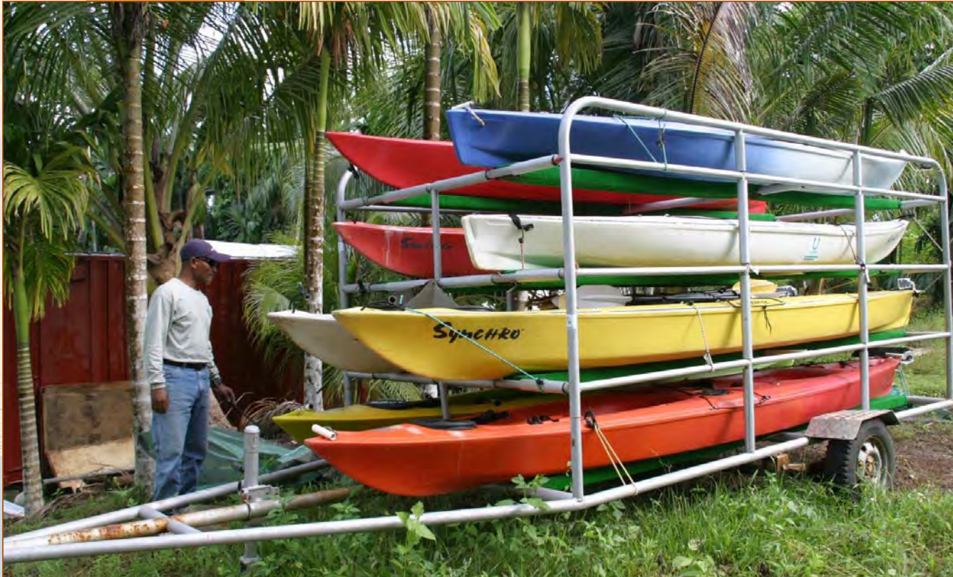
A partner from Ngaremlengui examines kayaks that will be used as part of an ecotour in the Ngeremeduu Bay Conservation Area.

PCS worked with states to improve infrastructure to attract and control visitors and their impacts. Through a project funded by the Government of Spain, PCS and partners installed mooring pins for a future floating dock in the Ngeremeduu Bay Conservation Area. Infrastructure in the Ngardok Nature Reserve was improved, with the near completion of a Visitor's Center and Nursery. PCS and partners also worked with Ngaremlengui to design a trail and bridge to the Ngeremeskang River, and sought assistance to improve the trail to the Ngardmau waterfall. PCS partnered with experts at Koror State to install underwater anchor pins at Ngardmau's Ileyakel Beluu Conservation Area to minimize impacts from dive boats.