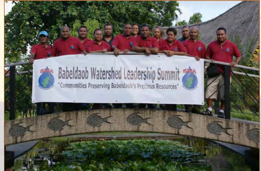
Left to right: Palau's Conservation Professionals gathered to identify joint targets and needs. The BWA brought together State leaders to work towards joint management of watersheds.