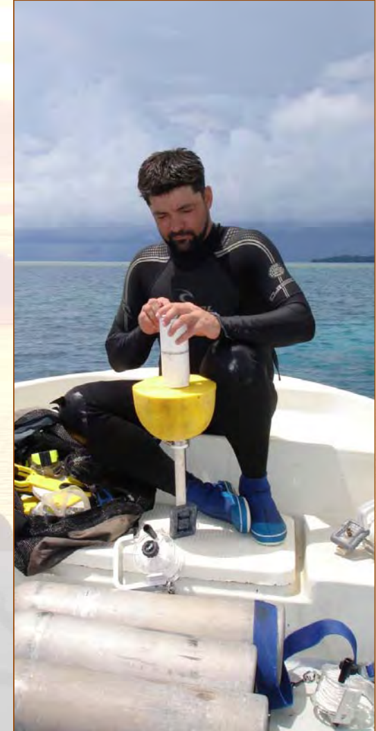
Top to bottom: Examining trochus size, PCS's Wildlife Health Coordinator studies a migratory bird. Right: PCS's Senior Marine Operations Officer sets up GPS equipment for a detailed study of Ebiil.