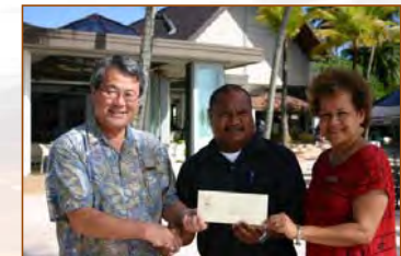
Left to right: Guests make friends with the PCS Biib Mascot at the 2009 Annual Fundraising Dinner. A PCS Board Member accepts a donation from the Palau Pacific Resort.