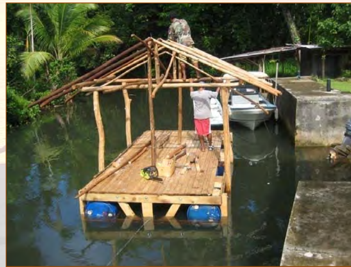
Left to right: PCS and partners examine dead rats in Fanna in preparation for the eradication. Access to a floating outpost and speedboats has enabled enforcement in Ngardmau's Ngermasech Conservation Area and decreased poaching.