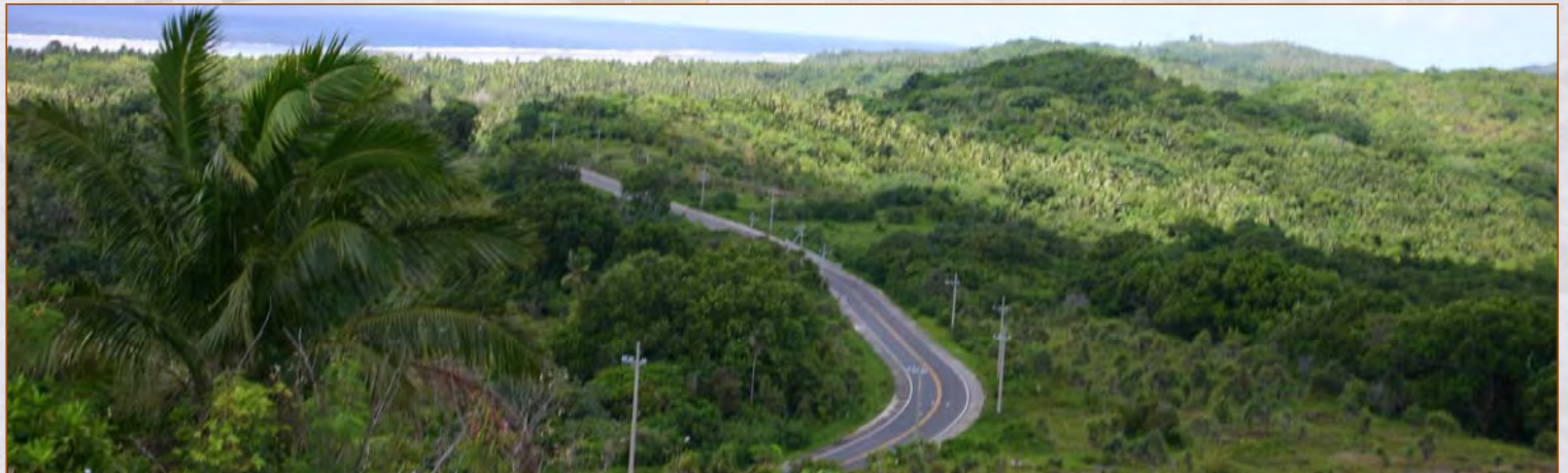
A section of the Compact Road with its asphalt cap.

Despite initial plans leaving out an asphalt cap on the road, Babeldaob's Compact Road was eventually capped in order to reduce sedimentation and erosion. Although this achievement resulted from the efforts of many partners, PCS helped by lobbying decision makers in the United States to cap the road. Land use planning efforts in Babeldaob are being undertaken to ensure that construction enabled by the Road is done so in a sustainable manner.