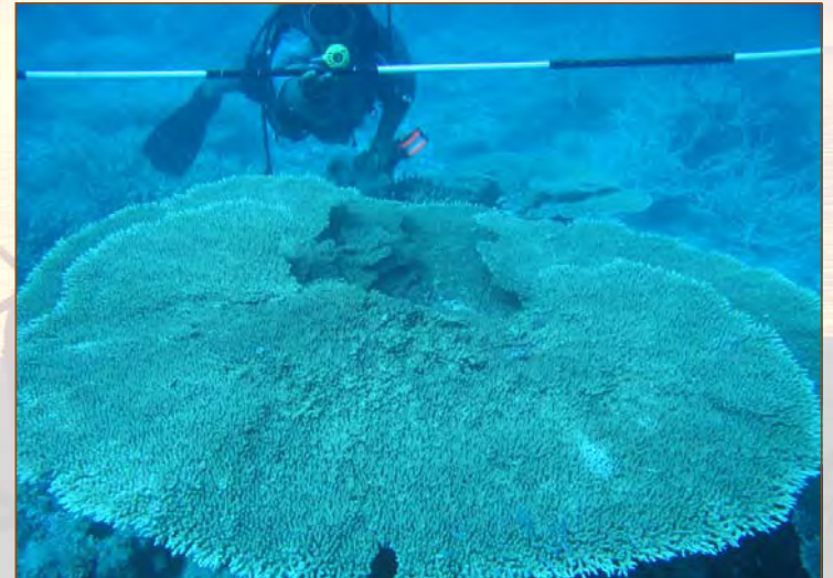
Left to right: State Conservation Officers receive SCUBA certification through a partnership with PCS and Sam's Dive Tours. Conservation Officers learned survey techniques in conservation areas such as Ebiil.