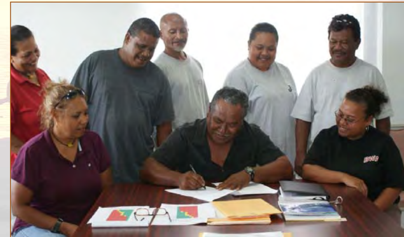
Left to right: A waterfall in the Ngeremeskang Nature Reserve; PCS and leaders from Aimeliik tour the Ngerderrar Conservation Area; the Governor of Ngiwal signs legislation establishing the Ngerbekuu River Nature Reserve.