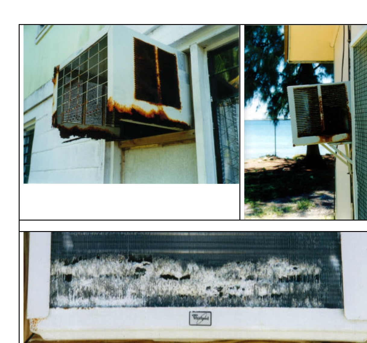
Annex 4 Corrosion in exterior air-conditioning equipment in Pacific Island Countries (PICs)