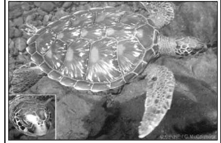
The Green Turtle - rare in the Southern Group ex cept for Palmerston. Found in the north. CINHP