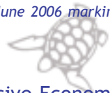
Left: Map as of 23 June 2006 marking Lady Vini's journey.

Since being tagged and released on 6 March 2006, Lady Vini has crossed the Exclusive Economic Zones (EEZs) of five Pacific island countries and territories, clearly illustrating the need for regional cooperation to conserve sea turtles.