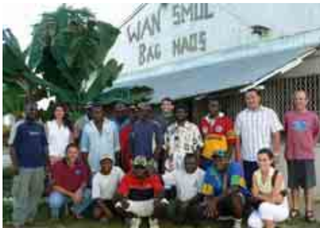
Members of Wan SmolBag, Western Fisheries Regional Management Council, Marine Research Foundation, and SPREP outside the Wan Smolbag office in Port Vila, Vanuatu.

Since 2004, SPREP has been working with a network of government agencies, non-government organisations, and community groups to collate all historical and current data on turtles