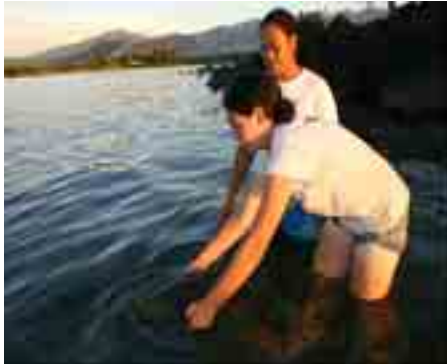
Volunteers releasing a tagged turtle into the ocean.

In celebration of their national launch, the Samoan Ministry of Natural Resources, Environment and Meteorology (MNREM) tagged and released 16 turtles that had been kept in captivity in the Malua Theological College fish pond.