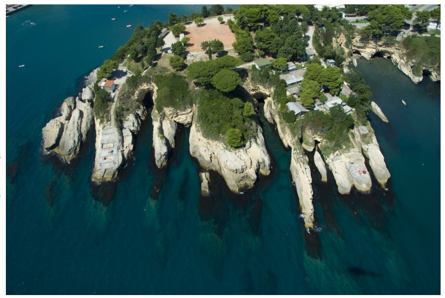
Ulcinj coastline

To provide a decision-making tool to guide the coastal development process toward sustainability, the first step in developing the ICZM Strategy was the preparation of a vul-