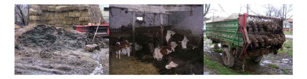
ID farm 7

Critical for this farm is collecting and storing of manure. Farm is a pure disaster considering stables, which are actually few improvised shelters plus one old stable without even basic conditions for dissent keeping of animals and collection of manure and effluents-liquid parts of manure. Effluents are running from shelter all around the farm in small creaks merging with those coming from stored manure and sucked in to soil. After manure is manually collected from stable, together with straw it's stored in improvised way on two places in the yard. Manure is loosing in many ways its value and polluting environment. From other side this is a good example of over-equipped farm with different machinery which is not used in full capacity and rationally.