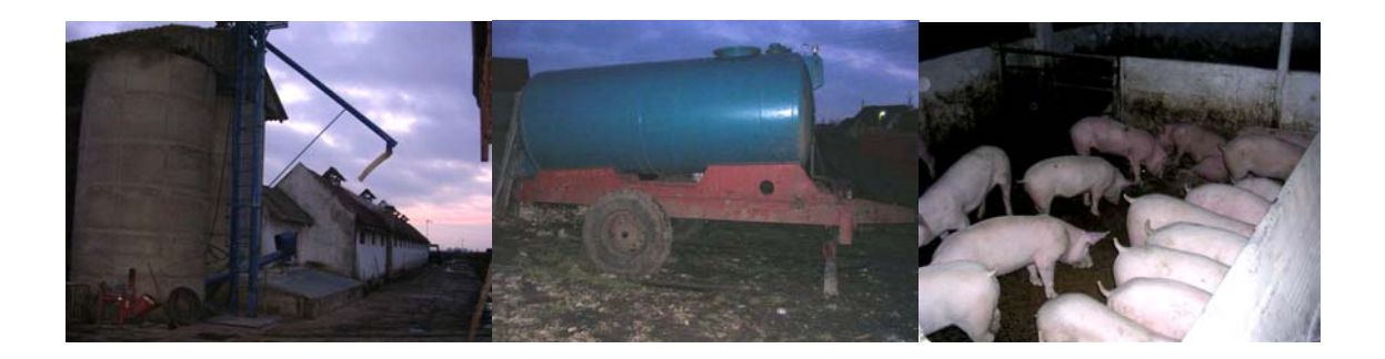
ID farm 5

All slurry produced on farms is used on farm crops. There is no enough slurry for 200 ha, which is close to the farm, but since tanks for storing slurry are not sufficient to hold slurry, farm still wastes slurry in May and Jun by spreading it on neighboring farms.