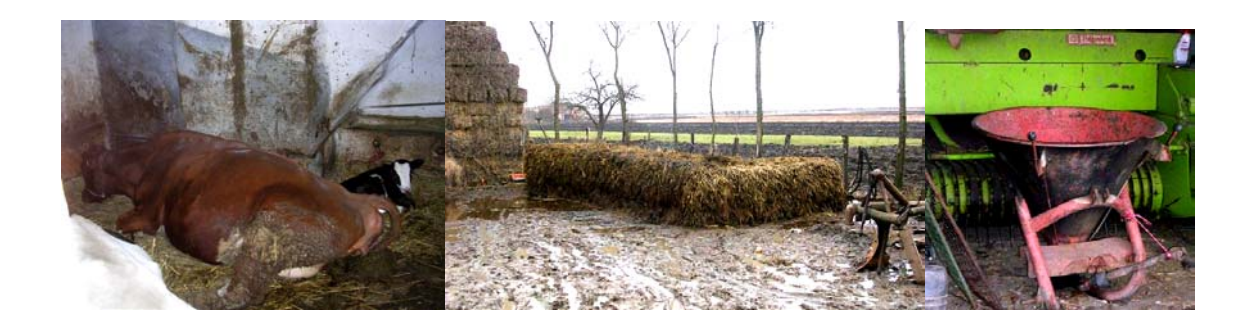
ID farm 8

This farm has few problems considering manure management. One is definitely storing of manure directly on soil, another manual distribution on fields. Considering their good habits in storing manure in very organized way, improving it with concrete storage and better distribution through purchase of manure distributor will help this farm look fine.