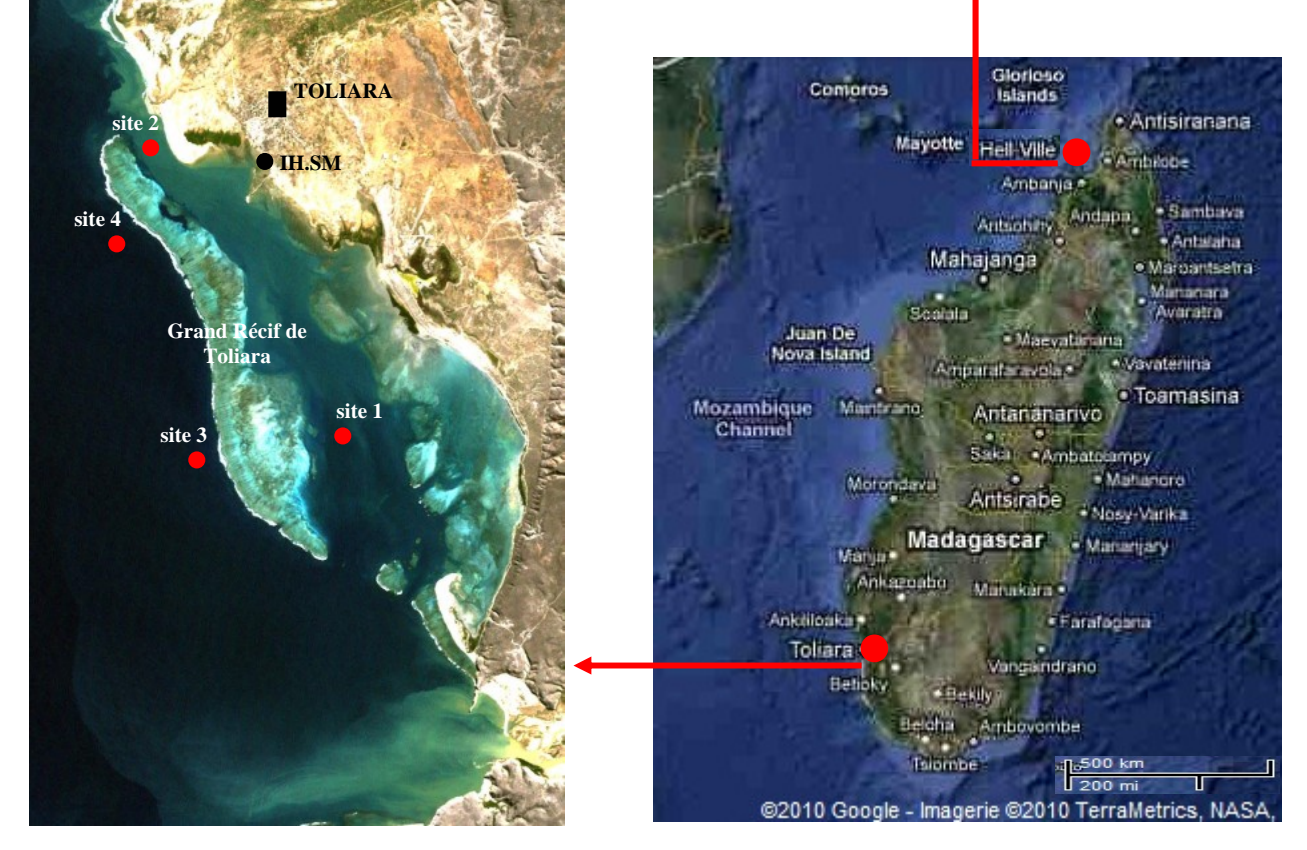
Fig. 1. Map of Madagascar