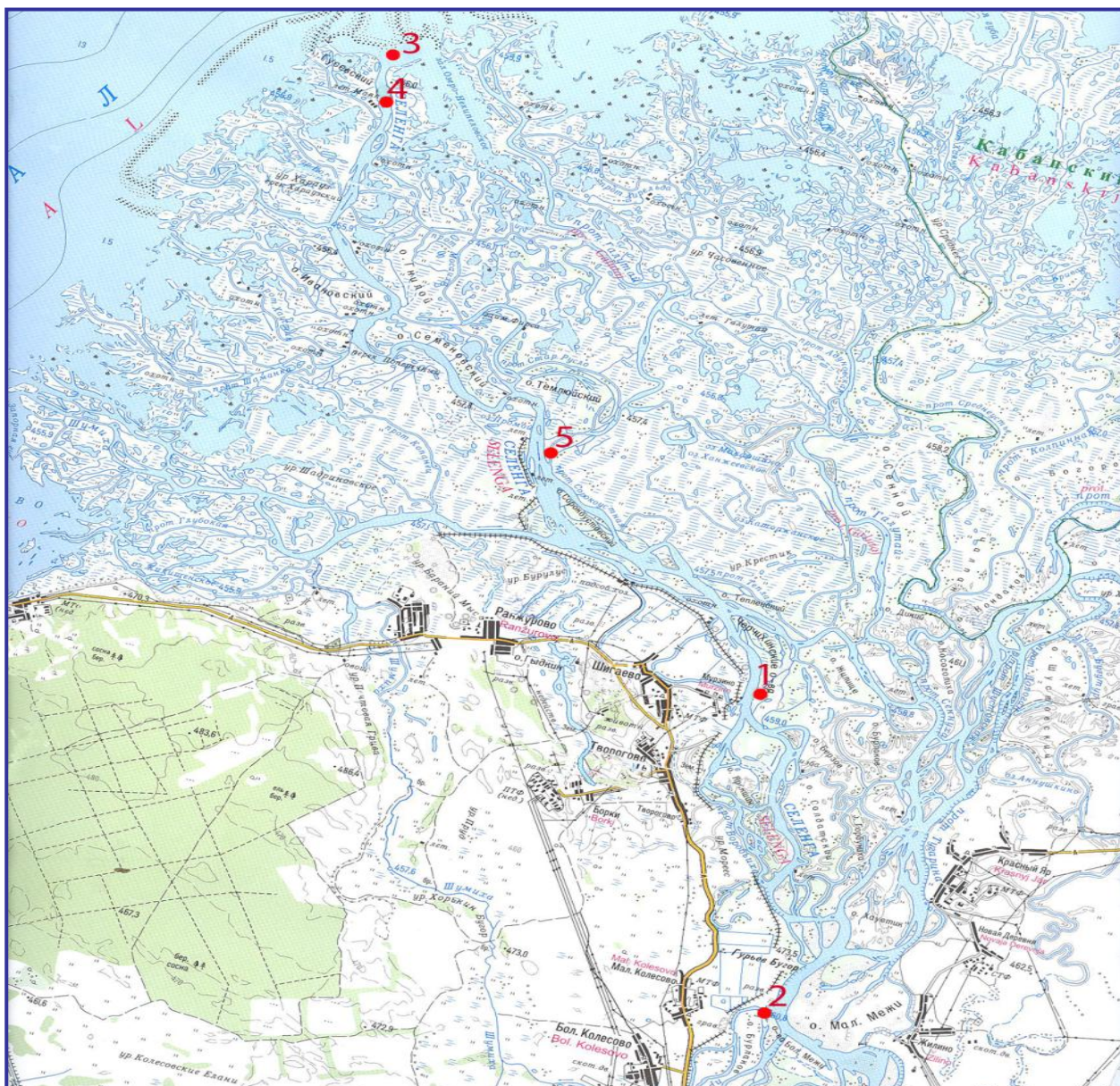
Fig. 1. Sampling map in Selenga delta area.

The choice of the branches of the southern delta group as objects of monitoring was primarily determined by their most significant input into the total volume of the river flow (up to 65 % in summer and up to 95 % in wintertime), and secondly, by their location in the most populated and acquired part of the delta. Remote sensors monitoring the water and air temperature were installed in the chosen locations and they recorded data throughout the entire study period. Hydrobiological and ichthyological samples were selected in accordance with the standard practice methods.