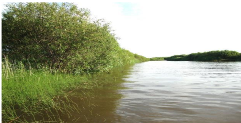
Fig. 2. Gusevskaya branch (station 1). General view of the duct and sampling point (marked by arrow).

The river flow rate decreased from August to October at all stations. A high river flow rate was registered in the lower reaches of the river at station # 4 (0.6 meters per second in August and 0.32 meters per second in October) and in the narrow Gusevskaya branch (Fig. 2) (0.52 mps in August and 0.44 mps in October). At station # 2 the river flow rates were minimal: 0.34 mps in August and in October the water there was quiescent.