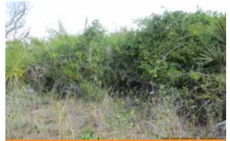
Land use planning. Pomene, Mozambique