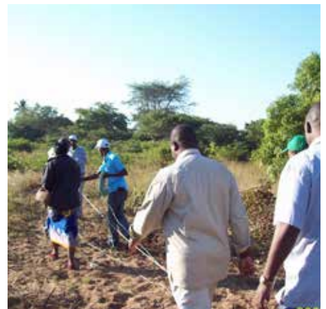
Land use planning. Pomene, Mozambique.