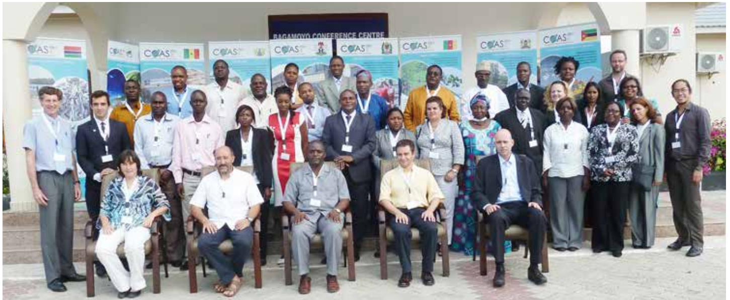
Group photo of the 5th Steering Committee Meeting held in Bagamoyo, Tanzania from 23rd to 28th September 2013 with participation of 38 partners (UNEP, UNWTO, UNIDO, EcoAfrica and representatives from nine participating countries)