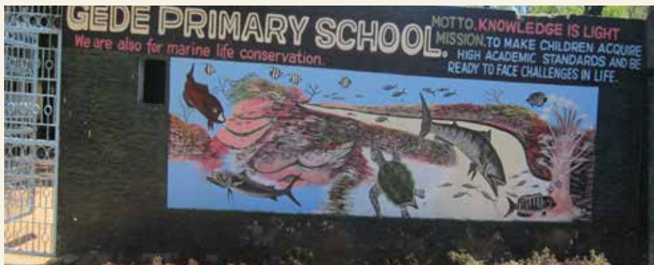
Environmental awareness in schools Watamu, Kenya

• Through the COAST Project partner EcoAfrica, a community training aimed at enhancing good practices in reef and marine tour guiding activities, the "Sea through the Looking Glass Boat" training was conducted. During the training, 57 participants from 11 organizations; including boat operators, government officials and DSMC representatives from Tanzania were trained from 22nd -24th July 2013.