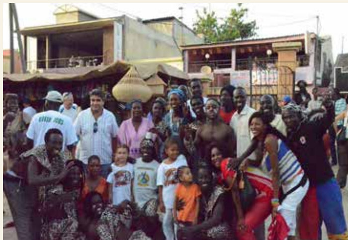
Public environmental activities Saly, Senegal