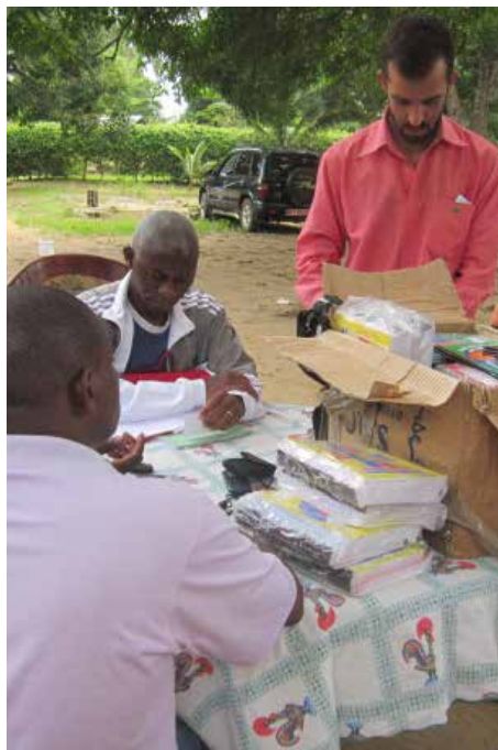
Publicity materials. Kribi, Cameroon