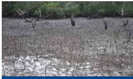
Mangrove re-generation. Bagamoyo, Tanzania