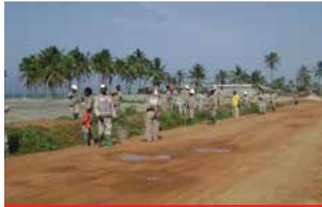
Waste collection efforts. Ada, Ghana