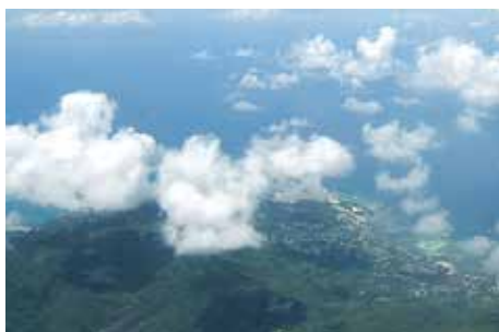
Aerial view of Seychelles