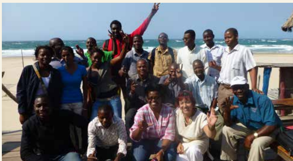
The members of the Inhambane Demo Site Management Committee posing for a photo