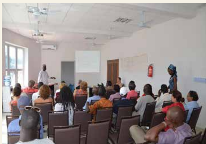
Lecture on food preservation in Saly, Senegal