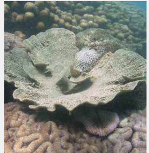
Plate coral from Bagamoyo Demo Site

In recognition of these challenges, the COAST Project is working to apply, through a series of practical demonstration projects in different thematic areas, a number of Best Available Practices and/or Best Available Technologies (BAPs/BATs) within selected coastal tourism destinations in Sub Saharan