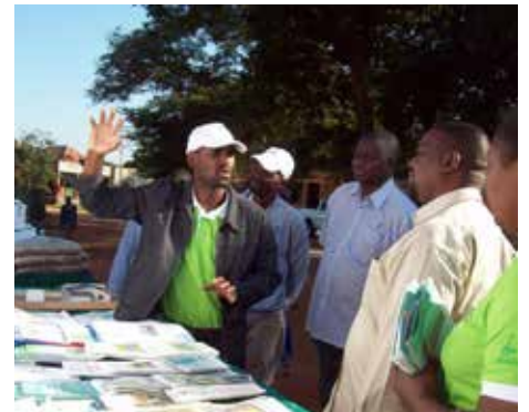
WED exhibition Inhambane, Mozambique