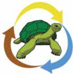
Seychelles Sustainable Tourism Label Safeguarding Seychelles for Tomorrow