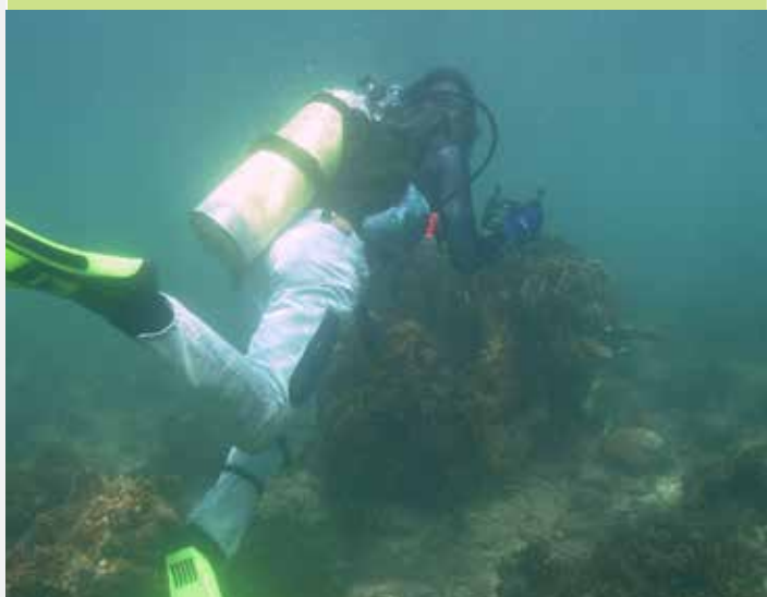
Reef assessment in Bagamoyo Demo Site

Bagamoyo currently provides a business-based tourism destination with the majority of visitors travelling from Dar es Salaam for meetings and conferences. The town also attracts short-term visitors from East Africa. The tourism industry is mainly land-based while marine recreation (snorkelling) is undertaken through largely ad-hoc arrangements with fishers and more recently with local tour guides. SCUBA diving is a recent activity and is currently offered by one operator in Bagamoyo. While the Lazy Lagoon attracts visitors for boating trips and snorkeling at some of the near shore reefs, the most popular snorkelling reef is Mwamba Kuni.