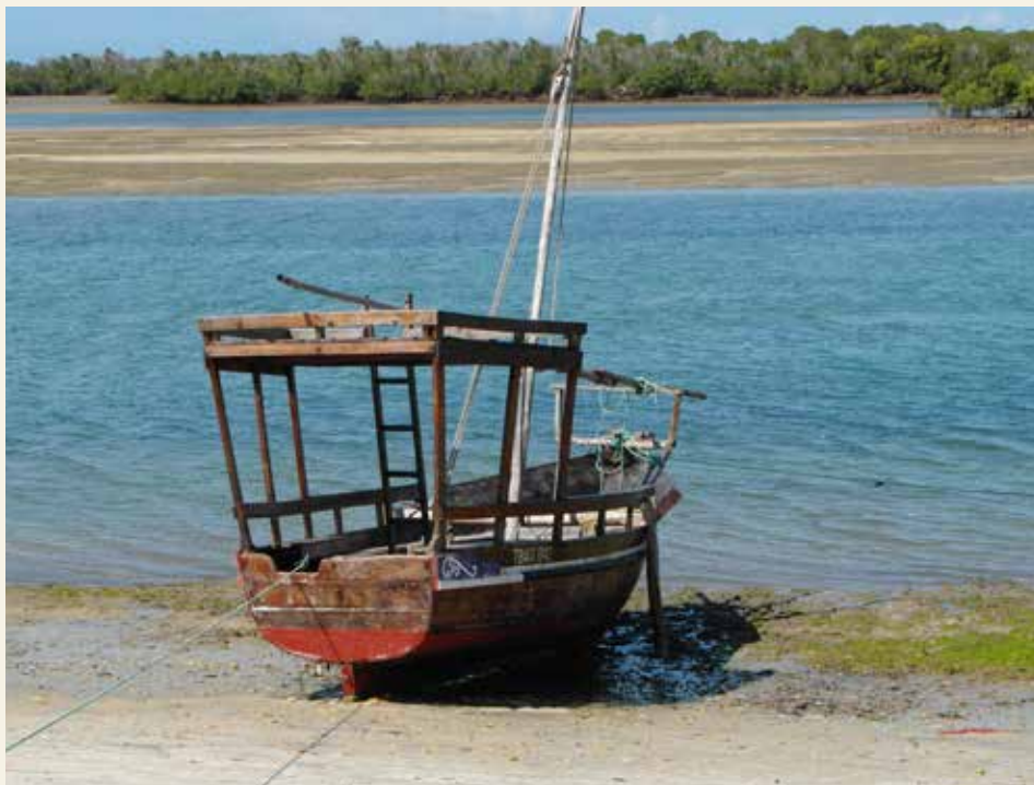
Traditional dhows in Bagamoyo, Tanzania