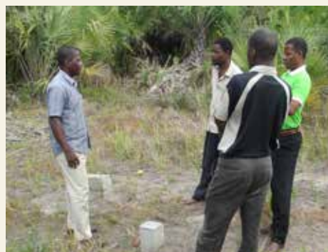
Beacons for the Pomene land use planning exercise in Inhambane, Mozambique