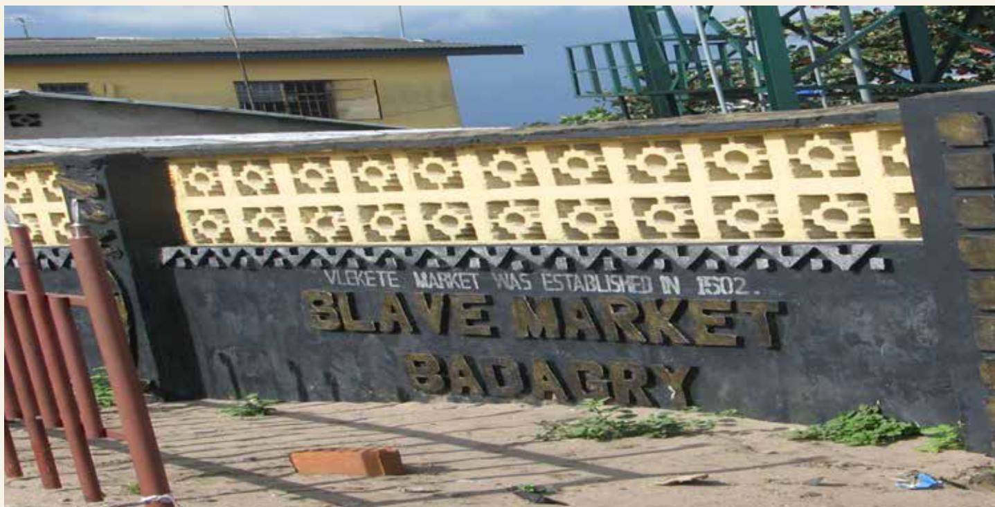
An ancient slave market in Badagry, Nigeria