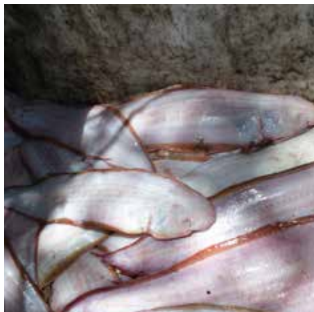
Fishing in Kartong, Gambia.