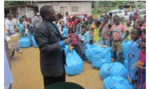
Educational talk with children on WED Kribi in Cameroon

The waste bins used in the beach cleaning were donated to the community and will be used during the periodic beach cleaning activities. The COAST project partners in Kribi also participated in the Environment Rally, a public gathering where environmental speeches were delivered by invited speakers, organized by the Kribi 1st urban council on World Environment Day. This rally was well attended by the local communities and the key government institutions in Kribi.