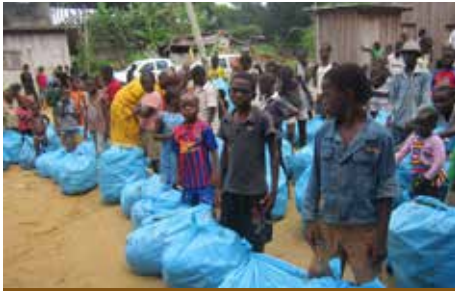
Collected waste. Kribi, Cameroon