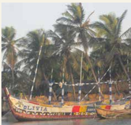
Coastal regeneration efforts in Ada, Ghana