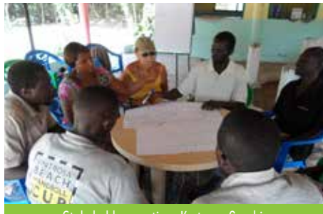
Stakeholder meeting. Kartong, Gambia