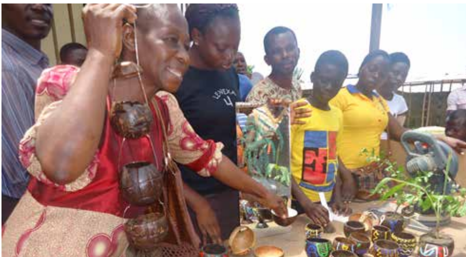
Crafts and eco-tourism products Badagry, Nigeria

SOME OF THESE ACTIVITIES HAVE NOW BEEN FEATURED BELOW IN PICTORIAL NARRATIVE: