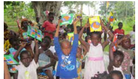
Children displaying their WED awards in Kribi, Cameroon