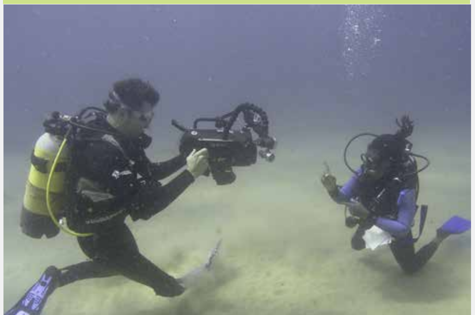
Video development for awareness-raising at TBT Demo Site

Despite this natural wealth, approximately 80% of the population lives in extreme poverty. With an extensive tropical coastline that is abundant with a rich natural and cultural heritage, Mozambique displays significant tourism development potential. The marine environment in the TBT area is however, highly sensitive and is threatened by destructive and excessive fishing, unplanned coastal development, pollution and unmanaged tourism activities. The tourism industry is one of the major employers for the local people and threats to its long-term sustainability are a serious concern to the locals, the private sector and government alike.