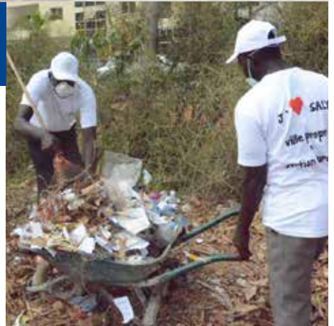
Waste collection. Saly, Senegal