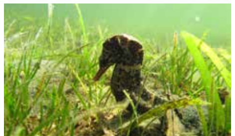
Seahorse Inhambane, Mozambique