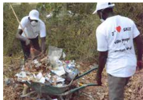
WED clean-ups Saly, Senegal