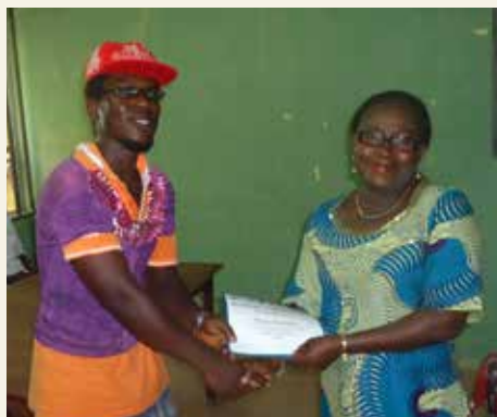
The Tourism Focal Point awarding a tour guide trainee Badagry, Nigeria