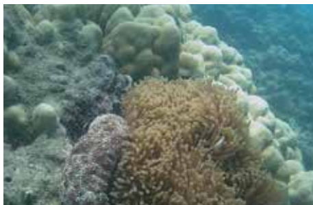
Coral reefs. Bagamoyo, Tanzania