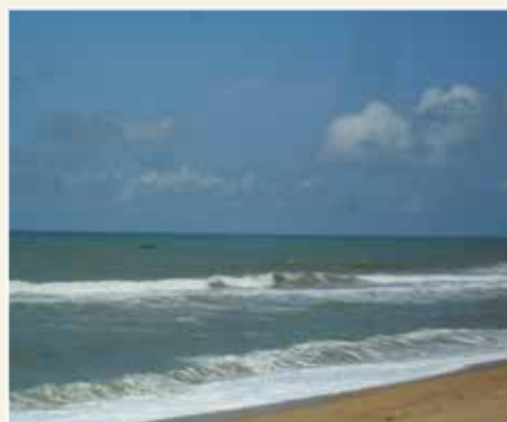
Clean beaches in Badagry, Nigeria