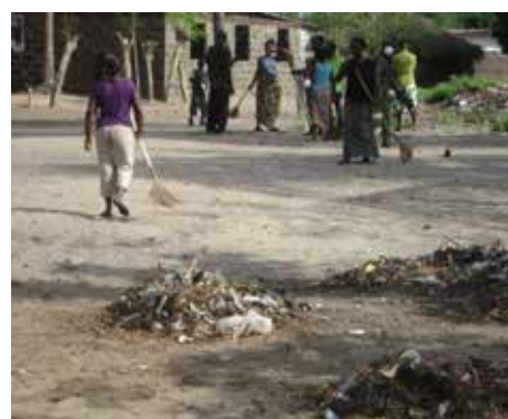
Street clean ups Ada, Ghana