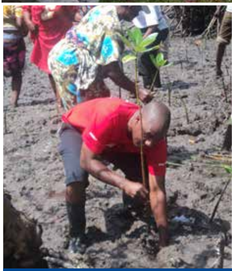
Mangrove re-planting. Bagamoyo, Tanzania.