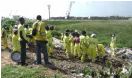
Waste collection. Ada, Ghana