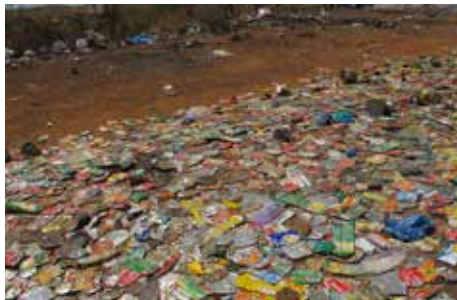
Recycling waste. Saly, Senegal