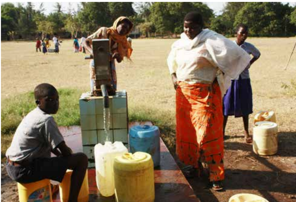
The key beneficiaries at the main water collection point in Chipande

For more information visit http://www.micro-water.org/5001.html