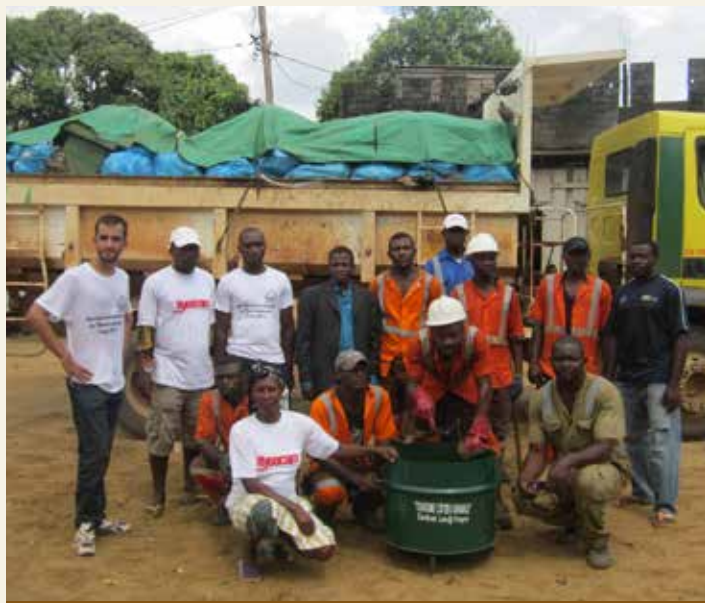
Clean up activities in Kribi, Cameroon