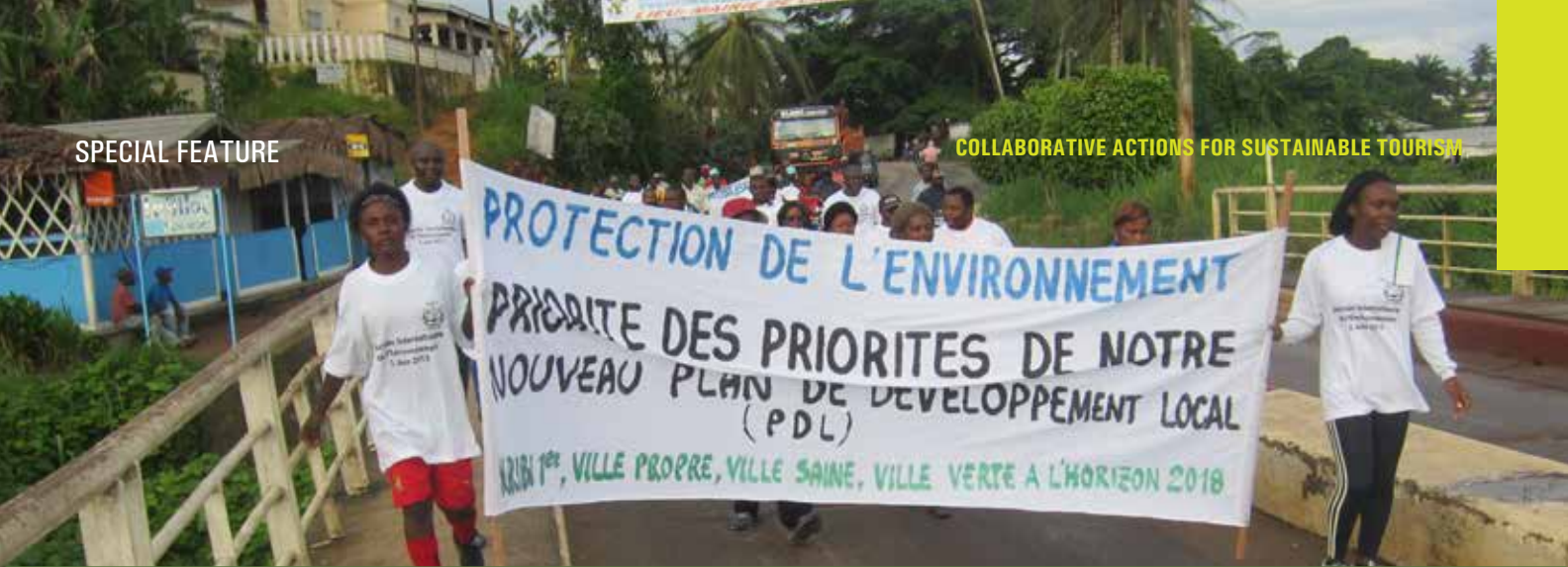
WED awareness raising event Kribi, Cameroon