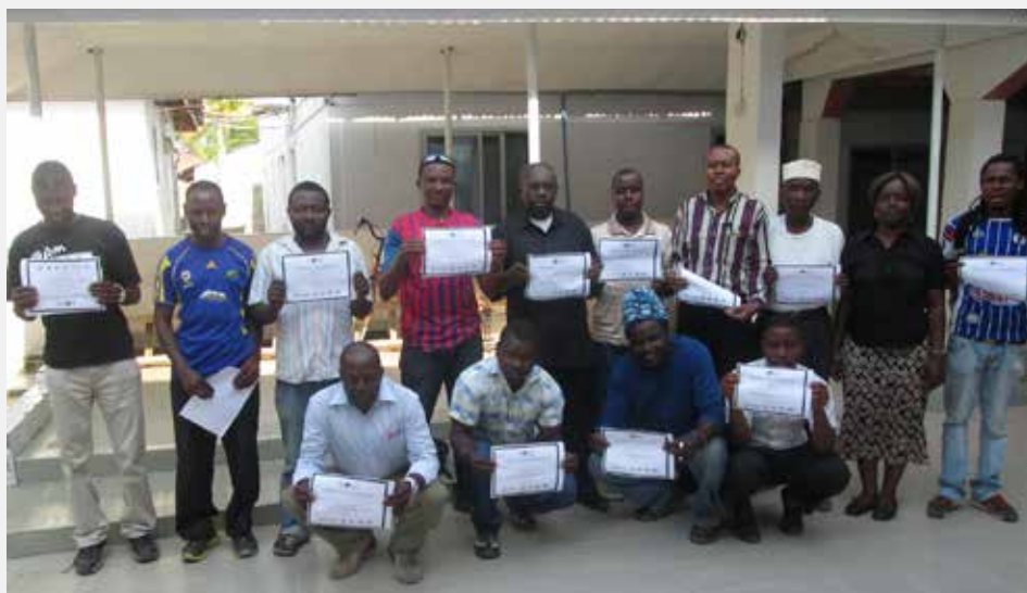
COAST Project guide training in Bagamoyo, Tanzania

For a highly extractive industry such as tourism to be socially, economically and environmentally sustainable, the industry needs to respond to the needs and aspirations and sensitivities of the local realities. The placement of local coastal communities central to future planning and management is critical to any efforts to improve the management of marine resources. It is absolutely clear that if tourism in coastal areas in the region is to be sustainable over the long-term, maintaining healthy marine ecosystems is critical and a change of mind-set amongst tourism operators and approach towards greater collaboration and sharing of benefits with local residents is essential. Increased responsibility by the tourism industry players through self-regulation and collaboration is key, especially in areas with a weak legal framework, a lack of adequate information for decision-making or weak monitoring and compliance of existing laws.