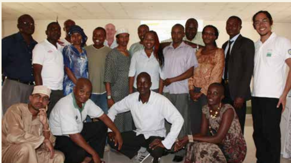
Participants from Kenya after a participatory stakeholder assessment training workshop in Watamu

Kenya is executing COAST Project activities under the three thematic areas Eco-tourism, Environmental Management Systems/Transfer of Environmentally Sound Technology (EMS/TEST) and Reef and Marine Recreation Management (RMRM).