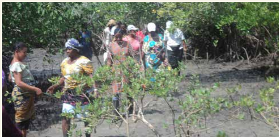
Community engagement in mangrove re-planting in Bagamoyo, Tanzania

• A short film was produced on the Bagamoyo Demo Site to share experiences and lessons on marine tourism.