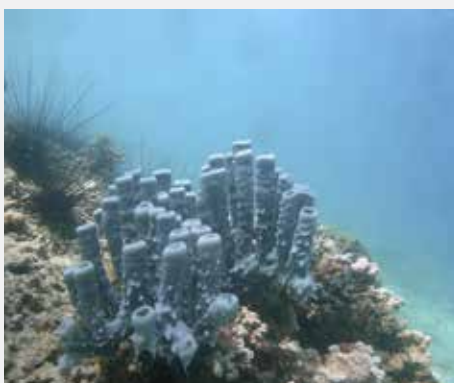
Tube Sponge from Bagamoyo Demo Site

".....Studies have estimated the total value of ecosystem goods and services provided by all the coastal ecosystems around the world to be over $25 billion per year..." (Conservation International).