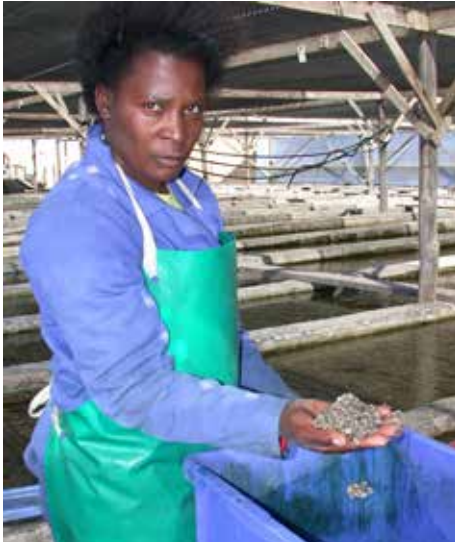
A worker separates oyster spat at a Namibian oyster farm. Aquaculture, shipping, coastal tourism, commercial fishing, marine mining and oil and gas production are the main economic activities in the BCLME.

Benguela is richly endowed with both living and non-living resources, including important commercial fisheries, substantial reserves of oil, gas and other minerals, like phosphates. The challenge facing the Benguela Current Commission is to balance the benefits of economic activities like oil and gas extraction with sound environmental management practices. One of the ways in which the BCC is confronting this challenge is by funding and supporting comprehensive science, training and capacity building programmes.