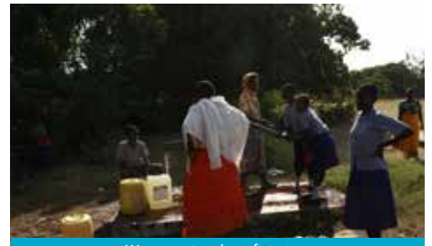
Water project beneficiaries. Watamu, Kenya.