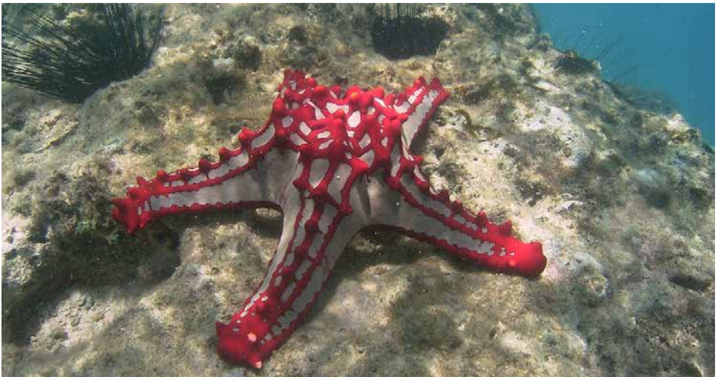
Red Spine Starfish off the coast of Bagamoyo Demo Site in Tanzania

At the three Demo Sites, we have completed the baseline research, which was done to provide an insight into each of the demo site contexts to identify key issues and opportunities. Preliminary reef assessments have also been done in each of the Demo sites to pilot potential assessment techniques for future management and monitoring of the sensitive sites and also to gain an insight into some of the sensitive areas. Mapping of the extent of demo site was done to indicate the area within which the RMRM activities are taking place. Participatory mapping has also been done in collaboration with a wide range of stakeholders at each Demo Site to identify areas of use and concern. This will also provide a basis for the mapping of the sensitive marine ecosystems identify options for improved management of marine tourism in the Demo Sites.