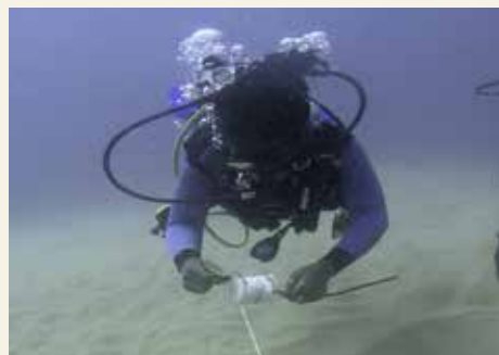
Transect during reef assessment in Inhambane, Mozambique