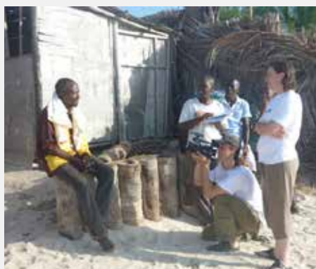
RMRM Team interviewing a local stakeholder, Watamu Demo Site