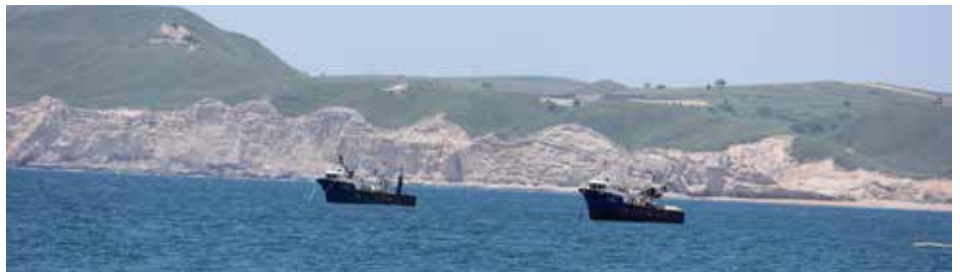
Fishing boats lie at anchor at the foot of Table Mountain in Cape Town. Tourists flock to attractions such as Table Mountain, but other activities, such as commercial fishing, also bring economic benefits to the countries of the Benguela Current Large Marine Ecosystem.

The BCC Institutional Capacity Development: In tandem with the Science, Training and Capacity Building programmes, the BCC is implementing a project to test and strengthen the structure and efficiencies of the Commission. Formally titled “Implementation of the BCLME Strategic Action Programme for restoring depleted fisheries and reducing coastal resources degradation”, the four-year initiative is usually referred to as the “SAP-IMP project”. Its objective is to implement the BCLME Strategic Action Programme (SAP) for the development and adoption of an effective trans-boundary LME management structure. The SAP Imp project is funded by the Global Environment Facility which, together with United Nations Development Programme (UNDP), has played a key role in building the BCC as an institution.