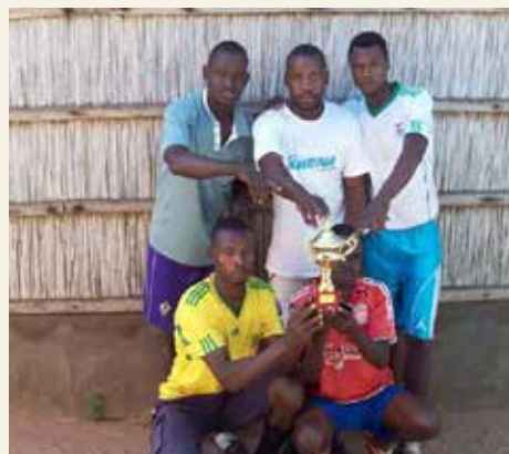
WED trophy winners Inhambane, Mozambique