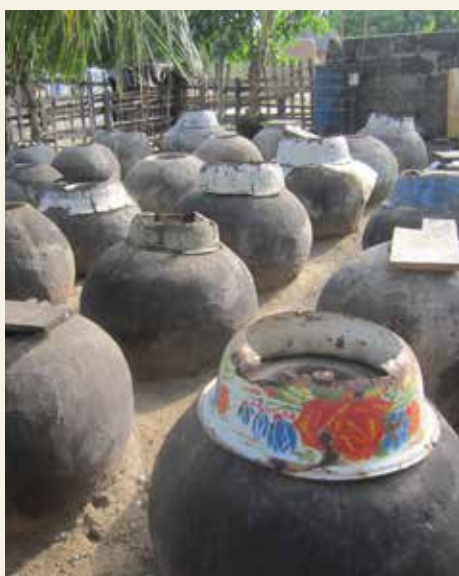
Local gin production in Ada, Ghana