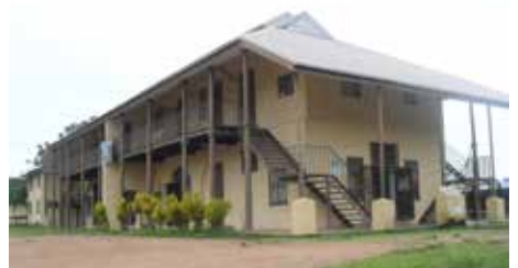
Historic slave museum. Badagry, Nigeria