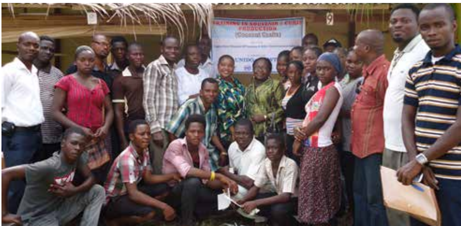
Crafts training workshop. Badagry, Nigeria.