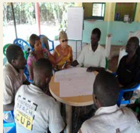
Community engagement workshops in Kartong, Gambia