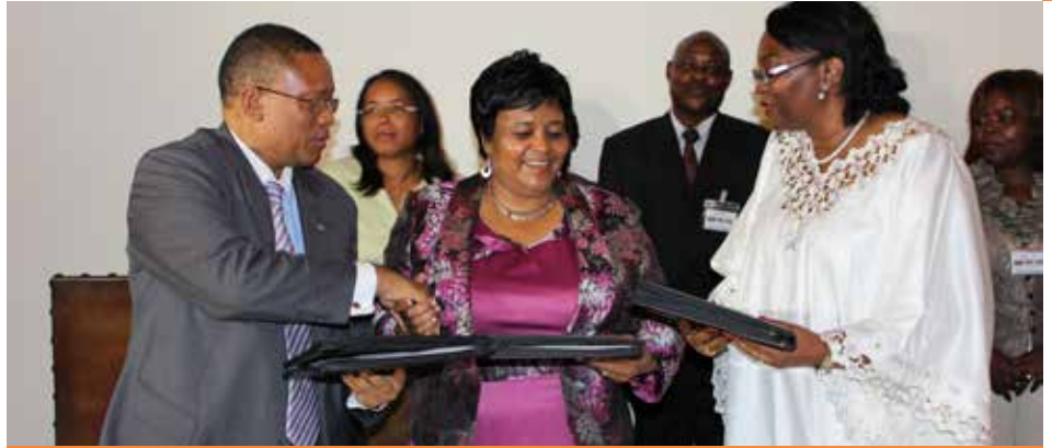
Bernhard Esau, Minister of Fisheries and Marine Resources in Namibia, Edna Molewa, Minister of Water and Environmental Affairs in South Africa and Victoria de Barros Neto, Minister of Fisheries in Angola, exchange signed copies of the Benguela Current Convention.