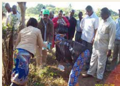
Tree planting activities in Inhambane, Mozambique