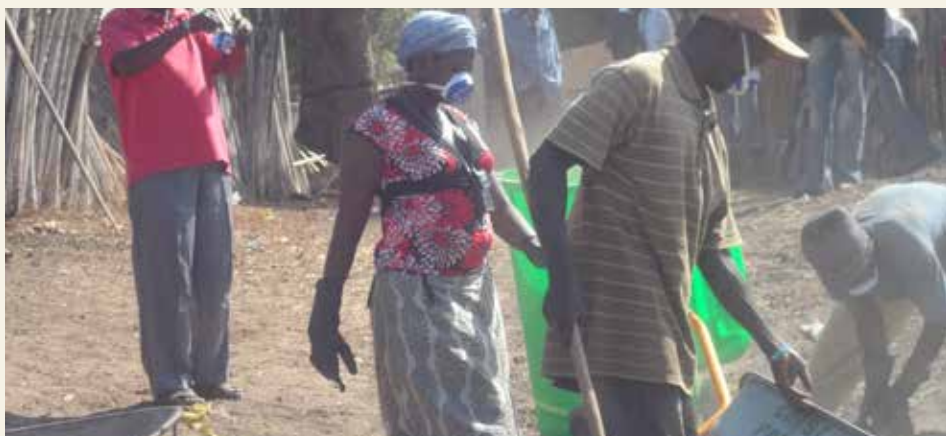
Public clean up even at Folonko in Kartong, Gambia