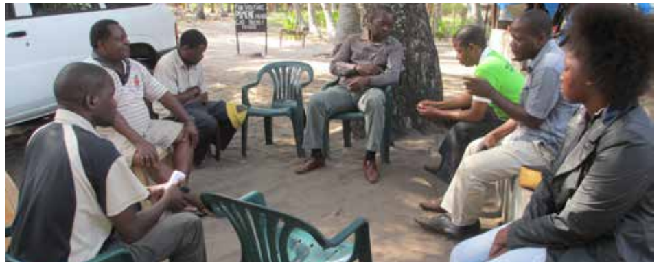
Public meetings on WED Inhambane, Mozambique