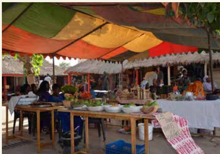
'Think.Eat.Preserve' food campaign Saly, Senegal

1. Commencement of the mapping of the demonstration site with the recruitment of a local mapping expert to generate maps of the demo site to show all the key touristic and geographical landmarks of the site.