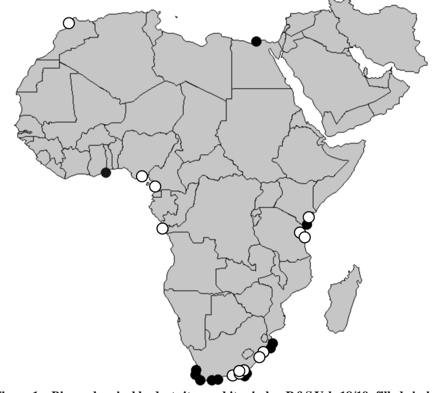
Figure 1. Biogeochemical budget sites – white circles, R&S Vols 18/19; filled circles, R&S 20.

- Langebaan Lagoon (20); Berg River estuary, Western Cape (20); Breede River estuary, Western Cape (20); Knysna Lagoon, Western Cape (18, 20); Gamtoos River estuary, St Francis Bay, Eastern Cape (18); Great Fish River estuary, Eastern Cape (20); Kariega River estuary, Eastern Cape (20); Kromme River estuary, St Francis Bay, Eastern Cape (18); Sundays River estuary, Algoa Bay, Eastern Cape (18); Swartkops River estuary, Algoa Bay, Eastern Cape (18); Mhlathuze River estuary, KwaZulu-Natal (18); Mvoti River estuary, KwaZulu-Natal (20); Nhlabane River estuary, KwaZulu-Natal (20); Thukela River Estuary, KwaZulu-Natal (18)