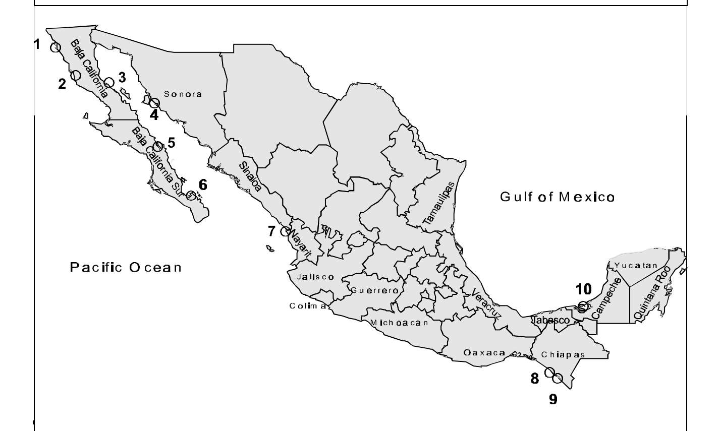
Figure 1. Map of Mexico showing names of coastal states and locations of budgeted lagoonal systems