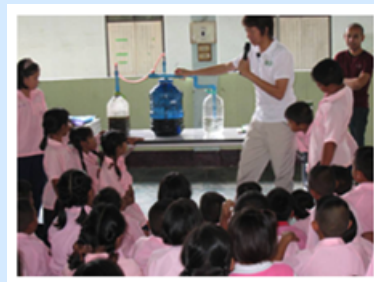
Doing a post test