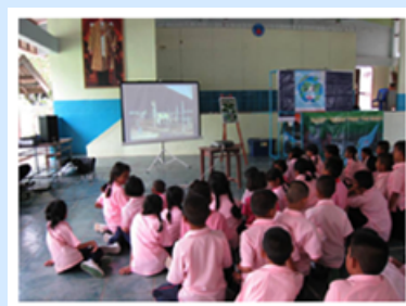
Demonstration of the biogas production