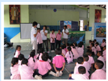
Watching a puppet show: "Happy Farm and a Pig Hero"