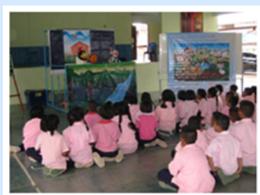
Creating livestock farm in their dream