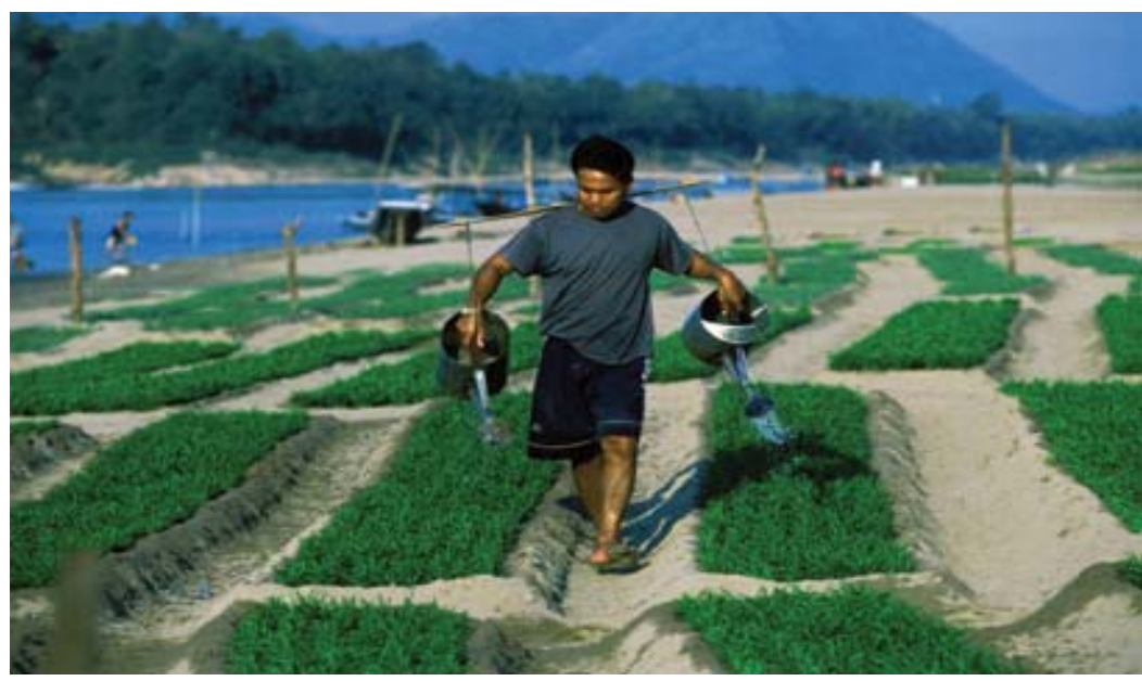
Growing vegatables on banks and sand bars of Mekong River.

Eight separate projects focusing on agricultural productivity and efficiency of water use in the Mekong region have received funding to the value of US$10 million through the Challenge Programme, a global research programme targeting important river basins around the world. Another three projects have been approved subject to the availability of funds.