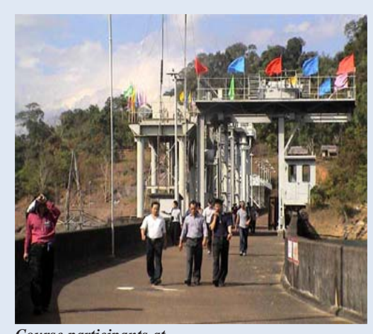
Course participants at the Nam Ngum hydropower dam

How might construction of dams affect the Mekong fishery? If irrigation increases, what changes in water quality can be expected? And what impacts would population growth have on demand for water?