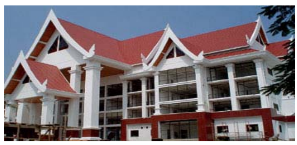
New MRC Secretariat building in Vientiane, Lao PDR.

Moves to shift the Mekong River Commission Secretariat from Phnom Penh to Vientiane are now well under way according to the relocation "road map" approved by the Joint Committee in 2003. Recruitment and training of Lao support staff are in process, and the new building is in the final stages of being fitted out.