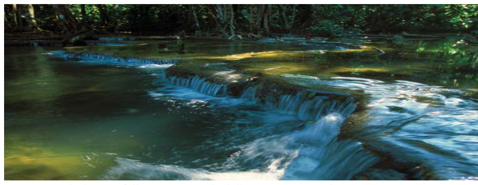
Prime watershed: Waterfall at Kwanxi in the hills near Luang Prabang

In the later years of the 1970s and '80s,