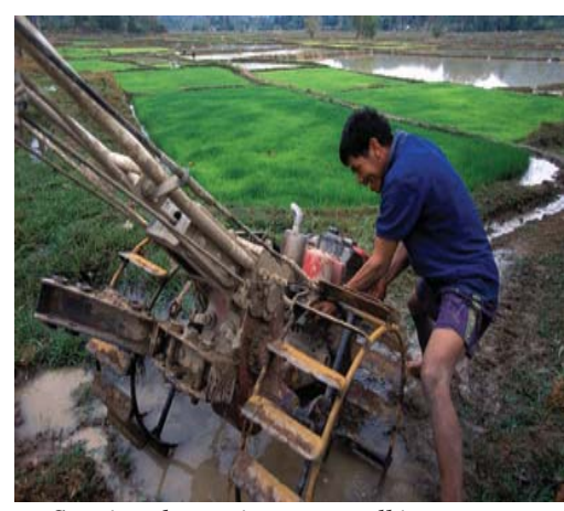
Starting the engine on a walking tractor.

Submissions for funding were coordinated by the Mekong River Commission through its network of partners in river basin management.