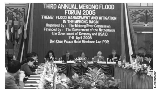
Experts from around the globe gathered to exchange knowledge and share lessons at the Flood Forum.

Topics under discussion at the 3AFF included disaster preparedness, early warning systems, forecasting tools, structural measures for flood proofing, capacity building, land management and the economic value of floods. International experts provided the benefit of their experience and the forum concluded with a