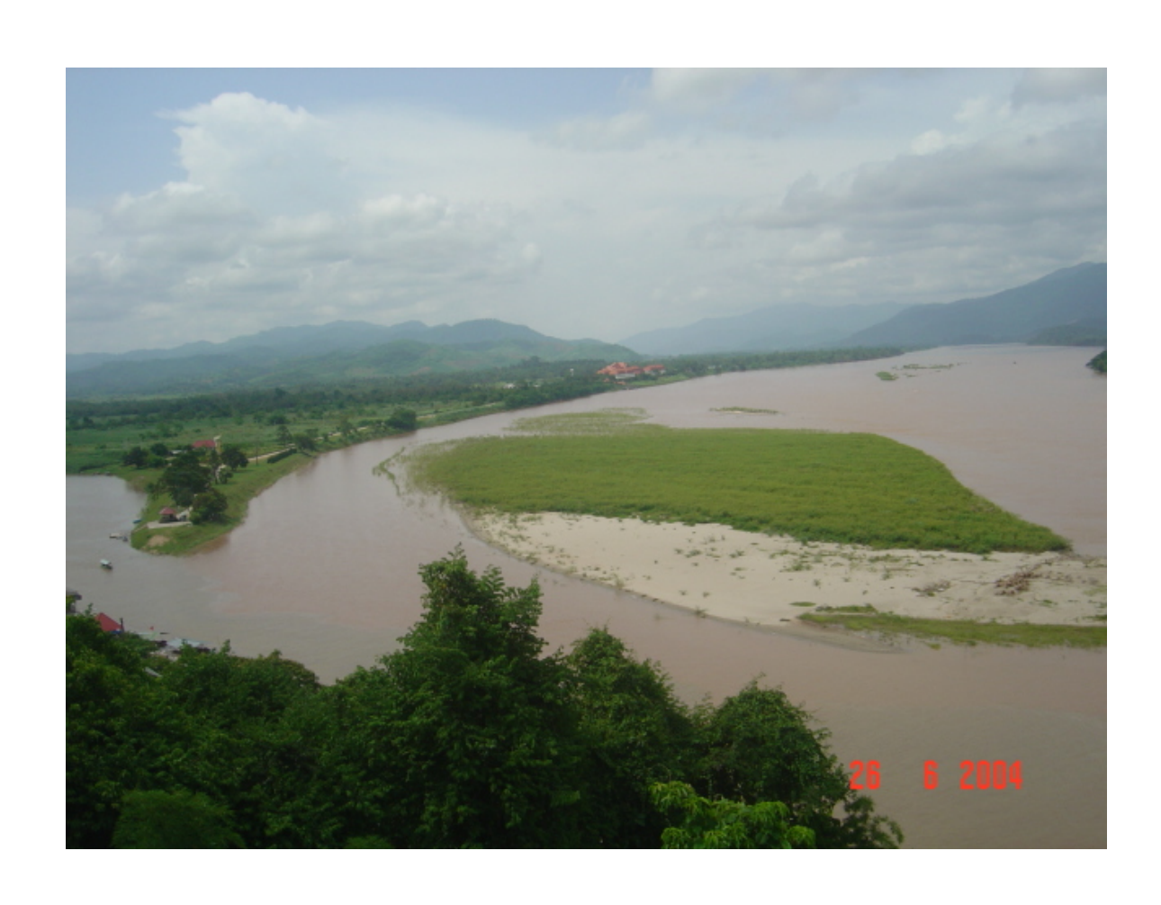
BDP UNIT THAI NATIONAL MEKONG COMMITTEE DEPARTMENT OF WATER RESOURCES MINISTRY OF NATURAL RESOURCES AND ENVIRONMENT