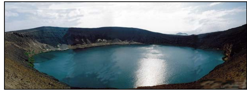
Bir Ali - Belhaf, Yemen

No reconnaissance visit to the Bir Ali - Belhaf survey area by the MPA - LS and the consultant has taken place during the MPA survey planning phase, or is currently planned to take place. Although this may change, both the MPA - LS and the consultant are already broadly familiar with the area. Details of logistical