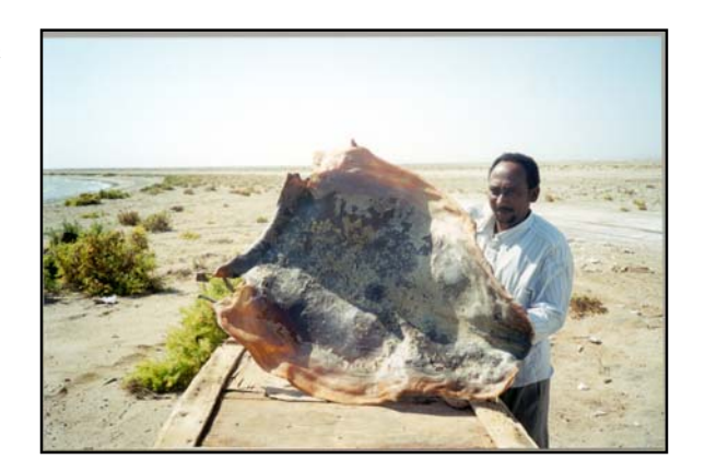
Dugong skin, Dungonah Bay, Sudan

3.1.4.i. Location & extent of the survey area