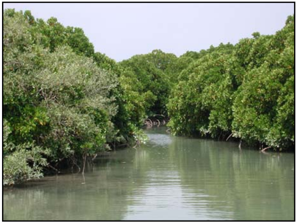
Mangroves at Saad ed Din

- All reefs, islands and shallows including Saad ed Din, Ceebad, Siigaale Shoal, Shaab Filfil & Shaab Turuxaad.