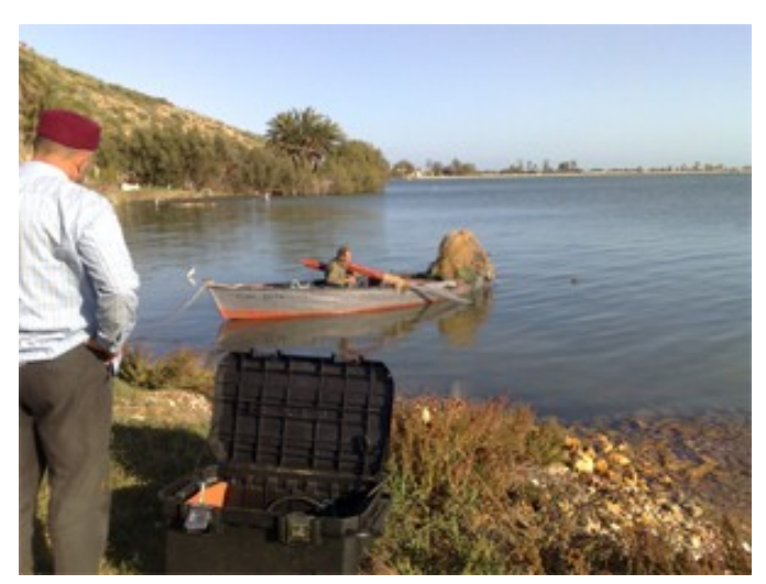
The Ghar El Melh coastal area in Tunisia.

Finally, the A.C.V.M. methodology developed for mapping the 'comprehensive vulnerability' of this system is a new concept and could be replicated at other Mediterranean coastal aquifers.