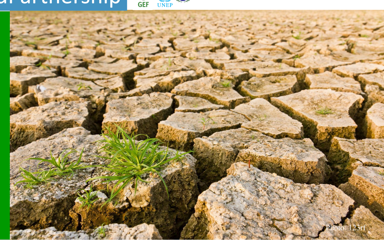
Aquifer vulnerability mapping: Evaluating simultaneously an aquifer's vulnerability to land-based pollutants and saltwater intrusion