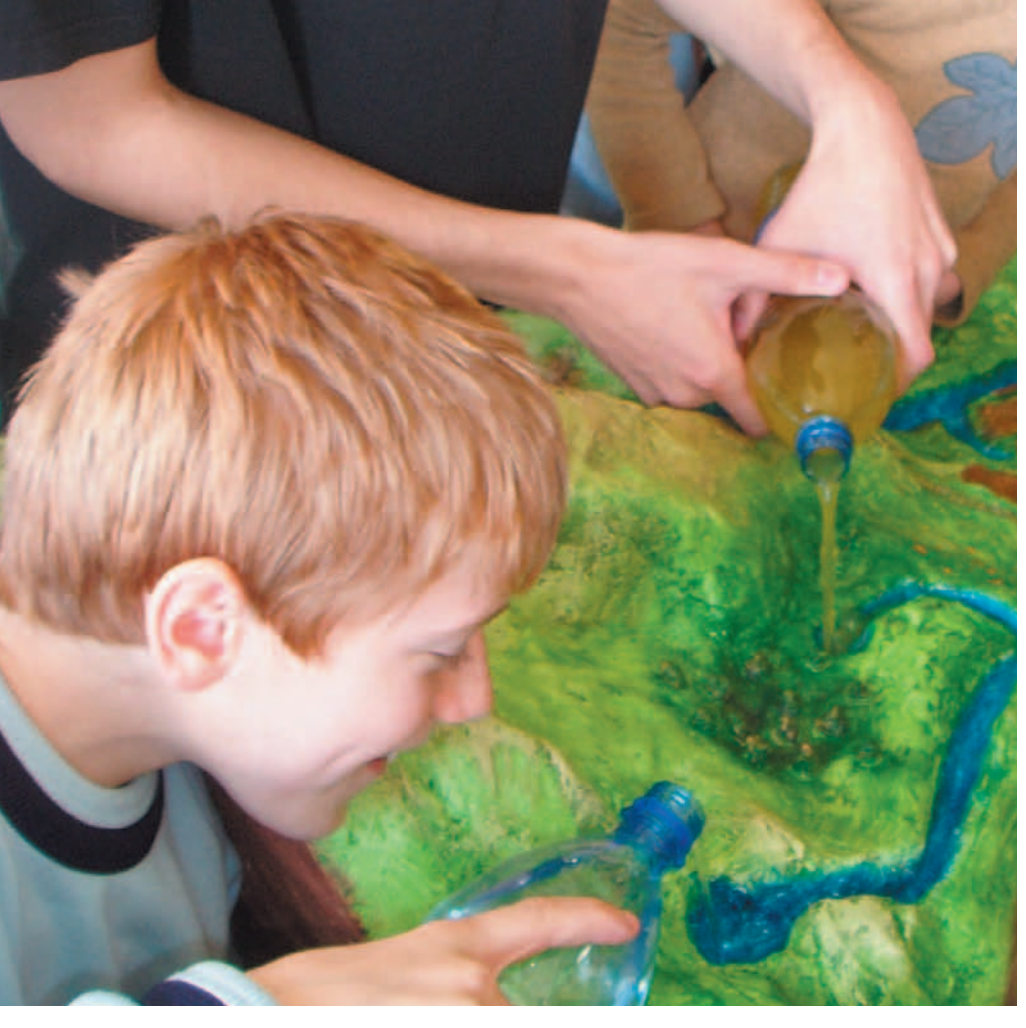
MESSAGE IN A BOTTLE: A student in Slovakia gets a lesson in watershed fundamentals.