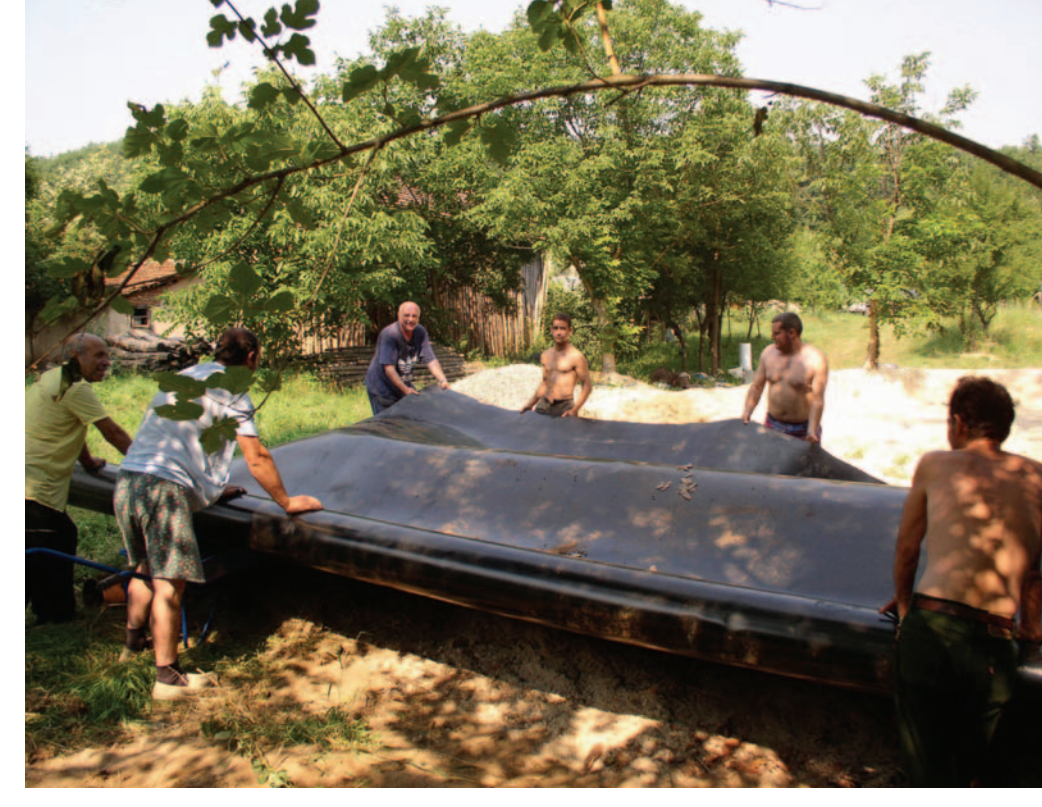
SPREADING THE WORD: A pollution-mitigation project in Bulgaria involved the creation of an artificial wetland.