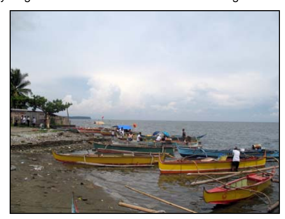
Artisanal fishers are key stakeholders in Masinloc

The experience of the Masinloc Coral Reef Demonstration Site provides a springboard for future efforts to sustainably manage the coastal waters and resources of Masinloc. The coastal waters have many users and managers, each with their own interests and objectives in using and benefiting from the coastal waters. Hence, there is a need to synchronise and synergise efforts to enhance resource management.