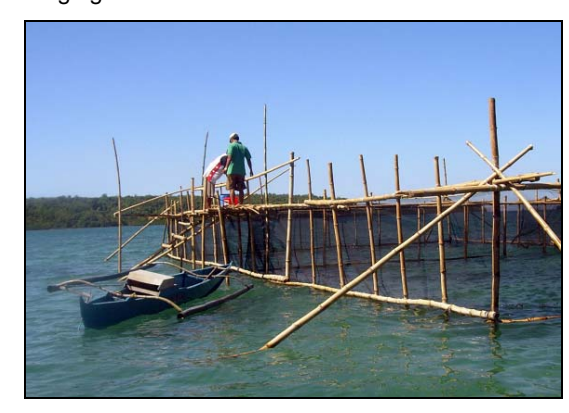
Aquaculture operators are also involved stakeholders

was given responsibility for the overall administration, management, policy formulation and implementation of actions relating to the sustainable use of coastal waters. The board is chaired by the Municipal Mayor and representatives of all the stakeholders are members. Regular quarterly meetings are convened to update members on the interventions and initiatives in managing the coastal waters of Masinloc.