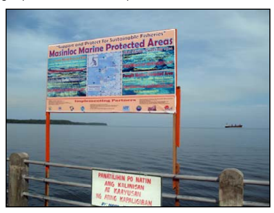
Sign for the network of four MPAs

Masinloc, in Zambales Province is accorded high priority among the Philippine biodiversity conservation priorities particularly with respect to benthic molluscs, and corals; and pelagic cetaceans, turtles, and whale sharks. It is imperative therefore that the Local Government Unit and all other stakeholders play a proactive role in ensuring sustainable use for the long term benefit of both the artisanal fishing community and larger private sector enterprises.