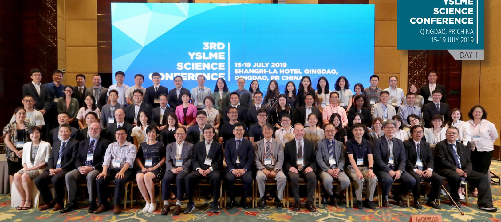
The participants posed for a group photo to mark the opening of the Third YSLME Science Conference.