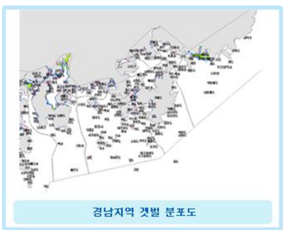
Figure 6. Tidal flats inBusan area