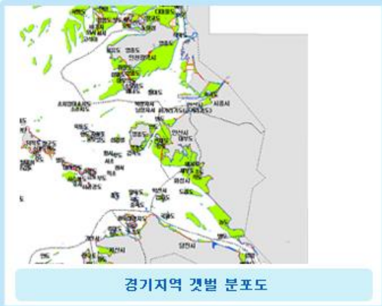
Figure 2. Tidal flats in Incheon area