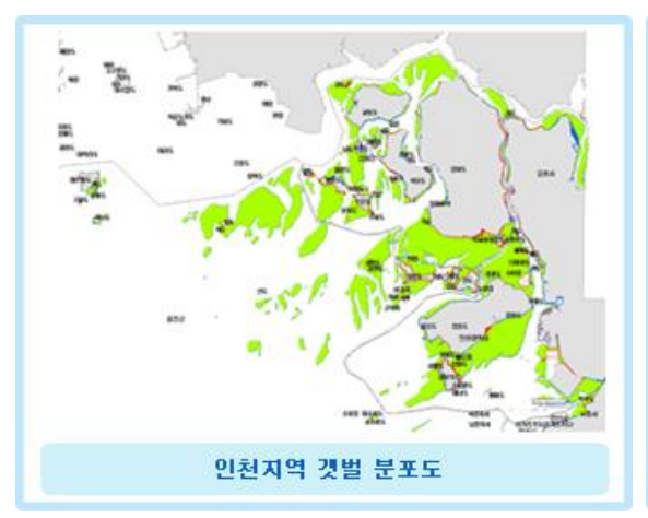
Figure 1. Tidal flats in Gyeonggi area

Figures 1 to 6 show the graphical presentation of the tidal flats along the coastal regions. Incheon and Gyeonggido have the richest tidal flats.