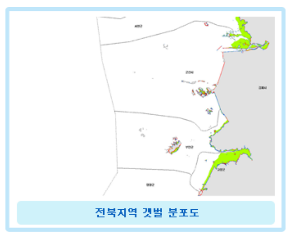
Figure 4. Tidal flats in Chungnam area