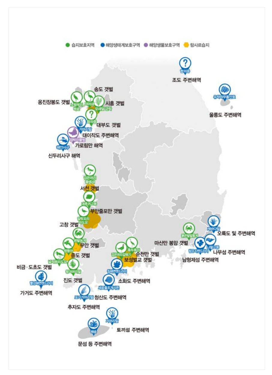
Figure 7. Location of MPAs in RO Korea