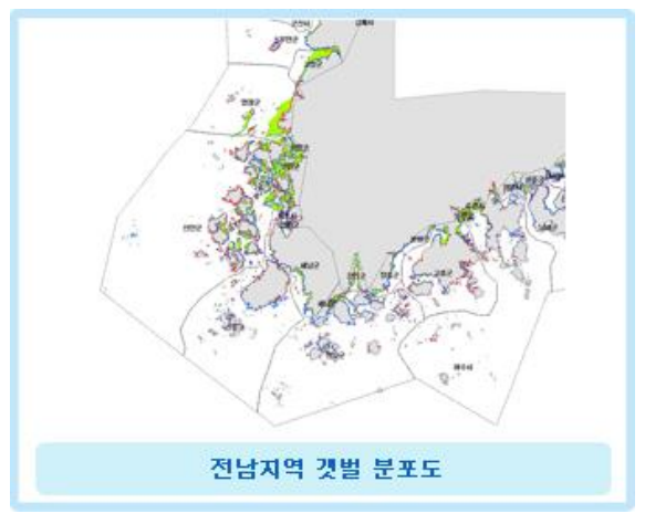
Figure 5. Tidal flats in Jollanamdo area